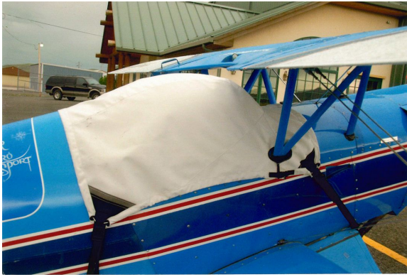
Acro Sport Canopy Cover

the hottest of days. It is water, ice and snow repellent, yet breathable to allow moisture to escape from between the cover and the aircraft surface.