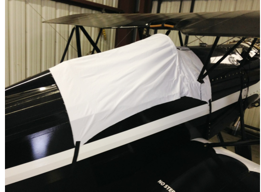
Rose Parrakeet Canopy Cover (test fit cover)