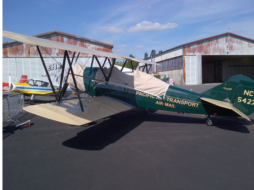
Travelair 4000 Canopy and Engine Cover

This cover type is made from Silver Acrylic Sunbrella canvas and is 100% lined with a soft and smooth microfiber. Bruce's Custom Covers developed this material combination especially for aircraft protection. The outer material is medium weight and treated for water resistance, UV resistance and anti-static buildup. The inner lining is a very soft and smooth microfiber to prevent scratching. The material is very reflective, and tests show that the cabin interior temperature can be reduced to near-ambient temperature on the hottest of days. It is water, ice and snow repellent, yet breathable to allow moisture to escape from between the cover and the aircraft surface.