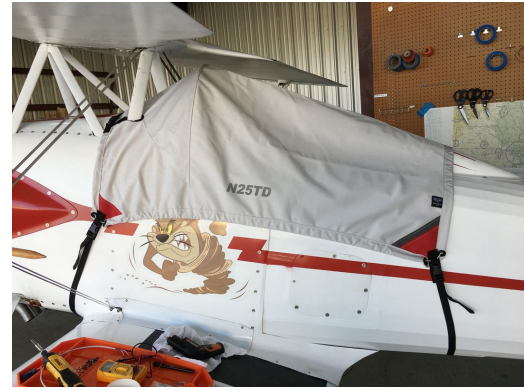
Lil Toot Canopy Cover