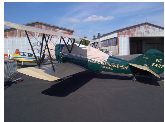
Travelair 4000 Canopy and Engine Cover