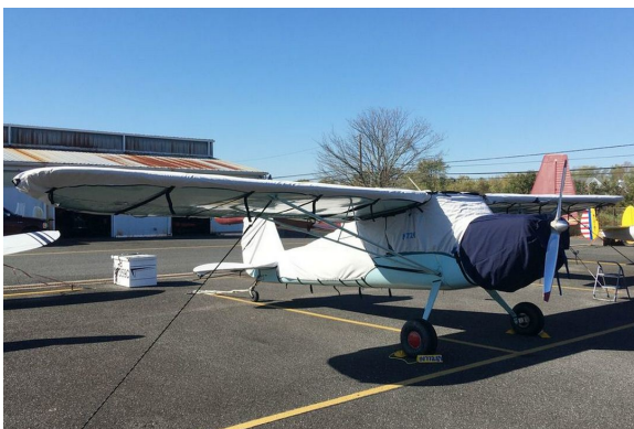
Cessna 140 Insulated Engine, Canopy, Empennage & Wing Covers

WINTER USE MATERIAL - Made with Solution-Dyed Polyester fabric, this option is intended for seasonal use to aid in deicing, rain mitigation, or for occasional travel. The material is lighter and more compact, but more susceptible to UV damage and may have a shorter useful life if used continuously outside than the all-year use material.