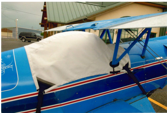
Acro Sport Canopy Cover

the hottest of days. It is water, ice and snow repellent, yet breathable to allow moisture to escape from between the cover and the aircraft surface.