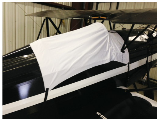
Rose Parrakeet Canopy Cover (test fit cover)