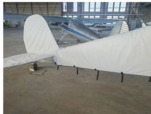
Cessna 140 Empennage Cover