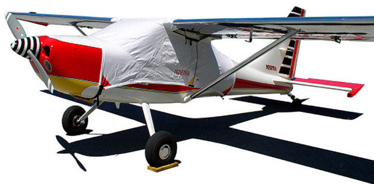
Glstar Over-Top Canopy Cover