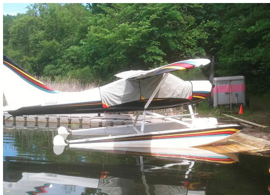
Glstar Sportsman Canopy Cover