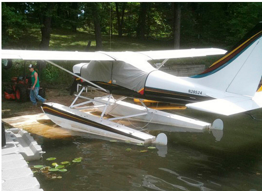
Glastar Sportsman Canopy Cover