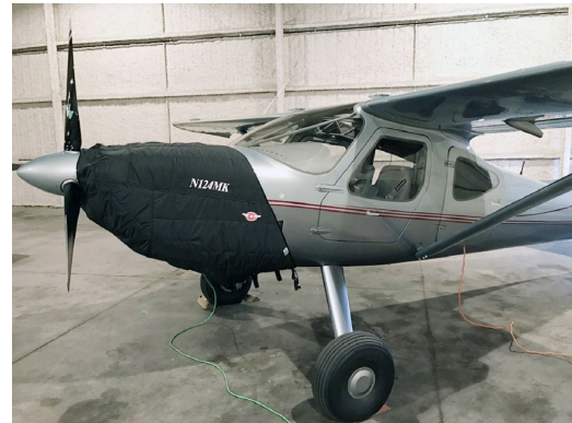
OMF Symphony Canopy, Wings, Horiz. Stab, and Prop Covers Glasair Aviation Glastar, Sportsman 2+2 Insulated Engine Cover