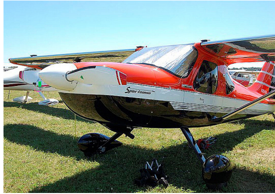
Glastar Sportsman Windshield HeatShield

more effective and practical for long-term protection.