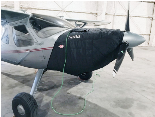
OMF Symphony Canopy, Wings, Horiz. Stab, and Prop Covers Glasair Aviation Glastar, Sportsman 2+2 Insulated Engine Cover