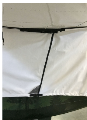
Vashon Ranger R7 Canopy Cover