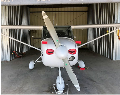
2006 OMF Symphony SA160

plugs have warning flags that are visible from the cockpit or 'remove before flight' streamers sewn onto the face of the plugs. Most plugs are imprinted with the aircraft registration number in black for an extra charge. Storage bag NOT included. Engine plugs may be inserted after flight when the engine is still warm. Engine Inlet Plugs are commonly referred to as Cowl Plugs, Intake Plugs, Cowl Blocks, Engine Blocks, and Engine Bungs.