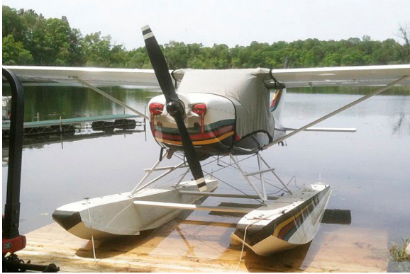
Glastar Sportsman Canopy Cover and Engine Plugs

plugs have warning flags that are visible from the cockpit or 'remove before flight' streamers sewn onto the face of the plugs. Most plugs are imprinted with the aircraft registration number in black for an extra charge. Storage bag NOT included. Engine plugs may be inserted after flight when the engine is still warm. Engine Inlet Plugs are commonly referred to as Cowl Plugs, Intake Plugs, Cowl Blocks, Engine Blocks, and Engine Bungs.