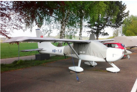
OMF Symphony Canopy, Wings, Horiz. Stab, and Prop Covers

This cover type is made from Silver Acrylic Sunbrella canvas and is 100% lined with a soft and smooth microfiber. Bruce's Custom Covers developed this material combination especially for aircraft protection. The outer material is medium weight and treated for water resistance, UV resistance and anti-static buildup. The inner lining is a very soft and smooth microfiber to prevent scratching. The material is very reflective, and tests show that the cabin interior temperature can be reduced to near-ambient temperature on the hottest of days. It is water, ice and snow repellent, yet breathable to allow moisture to escape from between the cover and the aircraft surface.