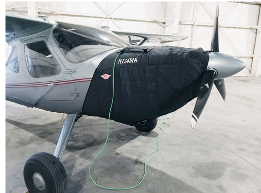
OMF Symphony Canopy, Wings, Horiz. Stab, and Prop Covers Glasair Aviation Glastar, Sportsman 2+2 Insulated Engine Cover