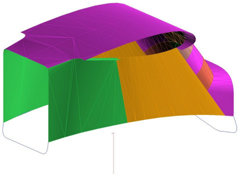
Vashon R-7 Ranger Canopy Cover, 3D model