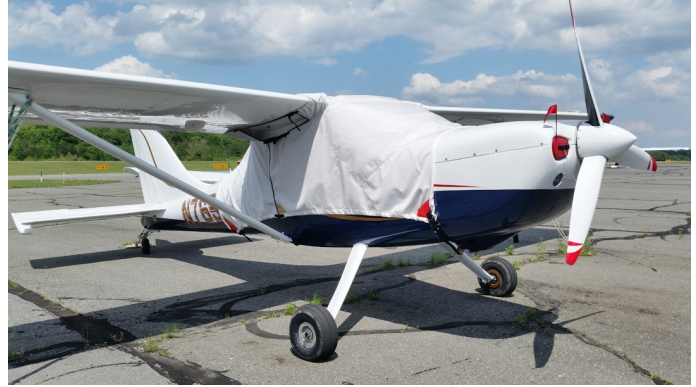
Glastar Over-Top Canopy Cover, Engine Plugs