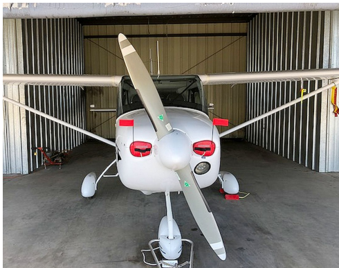
2006 OMF Symphony SA160