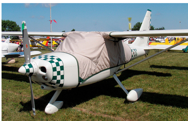
Glaster Over-Top Canopy Cover

This cover type is made from Silver Acrylic Sunbrella canvas and is 100% lined with a soft and smooth microfiber. Bruce's Custom Covers developed this material combination especially for aircraft protection. The outer material is medium weight and treated for water resistance, UV resistance and anti-static buildup. The inner lining is a very soft and smooth microfiber to prevent scratching. The material is very reflective, and tests show that the cabin interior temperature can be reduced to near-ambient temperature on the hottest of days. It is water, ice and snow repellent, yet breathable to allow moisture to escape from between the cover and the aircraft surface.