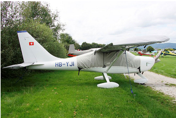
Glaser Canopy, Wings, Horizontal Stab. & Prop Covers

WINTER USE MATERIAL - Made with Solution-Dyed Polyester fabric, this option is intended for seasonal use to aid in deicing, rain mitigation, or for occasional travel. The material is lighter and more compact, but more susceptible to UV damage and may have a shorter useful life if used continuously outside than the all-year use material.