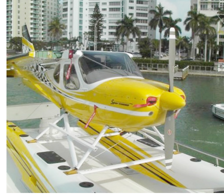
Glstar Engine Plugs