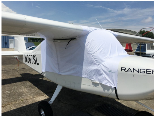
Vashon Ranger VR-7 Canopy Cover, test fit cover

Travel Covers are made with Silver Solution-Dyed Polyester fabric and only lined over the windshield to save weight. The material is lightweight and more compact for easy stowage in the aircraft. The polyester material is water resistant, but only intended for occasional use outside. We also have an ultra lightweight material available for fitted hangar dust covers. For daily outdoor use, the non-travel Sunbrella Cover is the best choice.