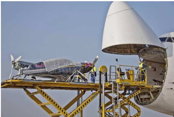
Extra 300 Canopy Cover

This cover type is made from Silver Acrylic Sunbrella canvas and is 100% lined with a soft and smooth microfiber. Bruce's Custom Covers developed this material combination especially for aircraft protection. The outer material is medium weight and treated for water resistance, UV resistance and anti-static buildup. The inner lining is a very soft and smooth microfiber to prevent scratching. The material is very reflective, and tests show that the cabin interior temperature can be reduced to near-ambient temperature on the hottest of days. It is water, ice and snow repellent, yet breathable to allow moisture to escape from between the cover and the aircraft surface.