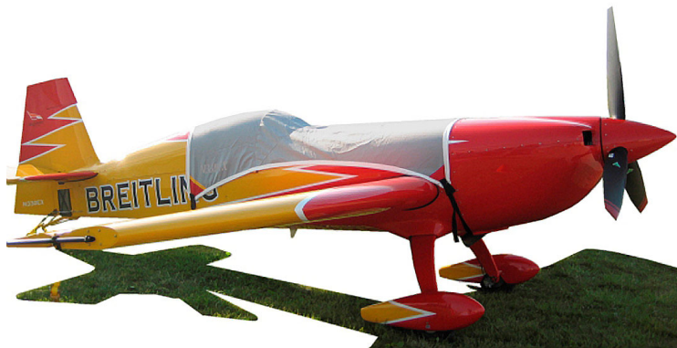
Extra 300sc Canopy Cover

Travel Covers are made with Silver Solution-Dyed Polyester fabric and only lined over the windshield to save weight. The material is lightweight and more compact for easy stowage in the aircraft. The polyester material is water resistant, but only intended for occasional use outside. We also have an ultra lightweight material available for fitted hangar dust covers. For daily outdoor use, the non-travel Sunbrella Cover is the best choice.