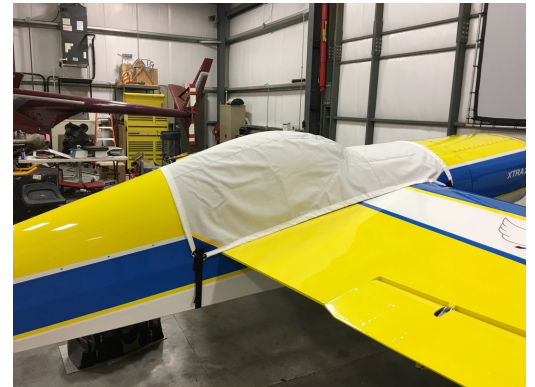
Extra 230 Canopy Cover