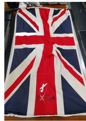
Custom Full-Cover Artwork