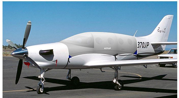
Epic LT Canopy Cover & Engine Plugs