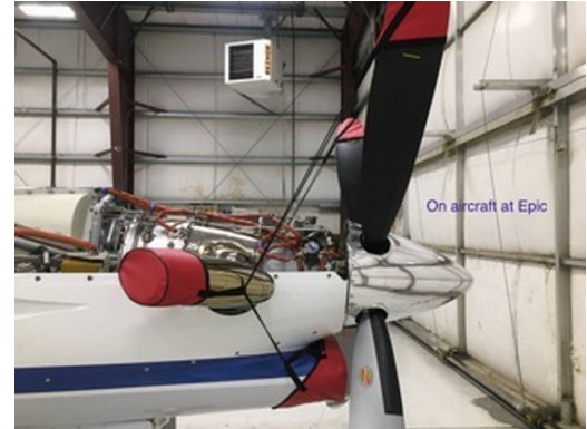
Epic Aircraft Prop Tie, Exhaust & Intake Covers