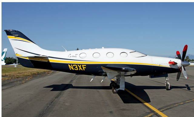
Epic LT Cockpit & Cabin HeatShields

This cover type is made from Silver Acrylic Sunbrella canvas and is 100% lined with a soft and smooth microfiber. Bruce's Custom Covers developed this material combination especially for aircraft protection. The outer material is medium weight and treated for water resistance, UV resistance and anti-static buildup. The inner lining is a very soft and smooth microfiber to prevent scratching. The material is very reflective, and tests show that the cabin interior temperature can be reduced to near-ambient temperature on the hottest of days. It is water, ice and snow repellent, yet breathable to allow moisture to escape from between the cover and the aircraft surface.