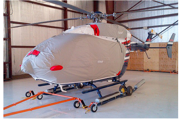
Main Body (also covers bottom), Tailboom, Vertical Pylon, Stabilizers and Tail Rotor Covers