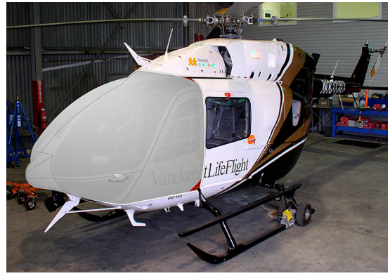
EC-145 Windshield/Nose Cover (illustration)