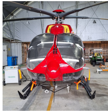
Airbus Helicopter H145D3 Windshield Heatshields, Engine Plugs