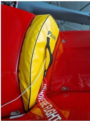
Airbus Helicopter H145D3 Intake Plugs

The Engine Inlet Plugs are custom fit for your Eurocopter EC-145, UH-145, BK-117 D-2 intakes, made with heavy-duty vinyl material, and stuffed with a single block of sculpted urethane foam. Each plug has a zipper that allows the foam to be removed and dried if necessary. Engine plugs have 'Remove Before Flight' streamers sewn onto the face of the plugs. Most plugs are imprinted with the aircraft registration number in black for an extra charge. Storage bag NOT included. Engine plugs may be inserted after flight when the engine is still warm. Engine Inlet Plugs are commonly referred to as Cowl Plugs, Intake Plugs, Cowl Blocks, Engine Blocks, and Engine Bungs.