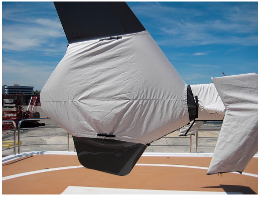
EC-135 Tailfan Cover and Tailboom Stabilizer Cover