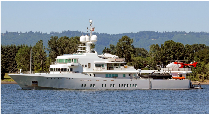
Eurocopter EC-145 Bubble Cover