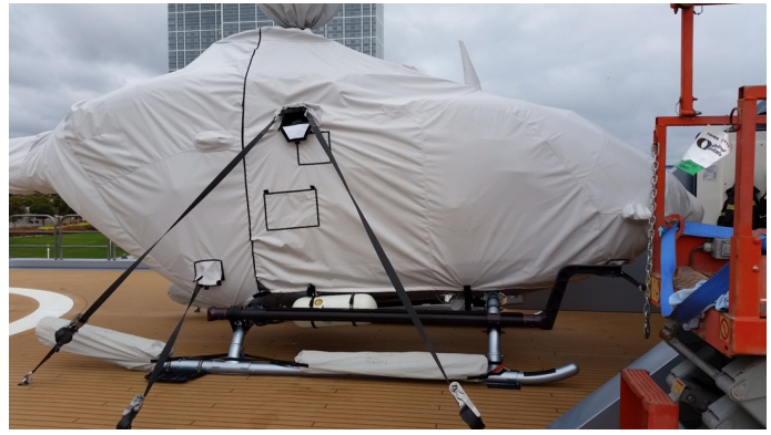
EC-135 Full Cover Set