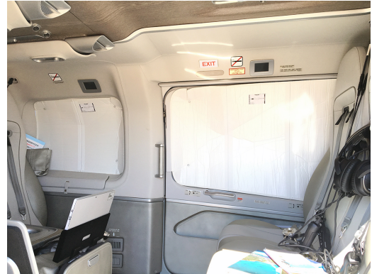
Eurocopter EC-145 Cabin Heatshields