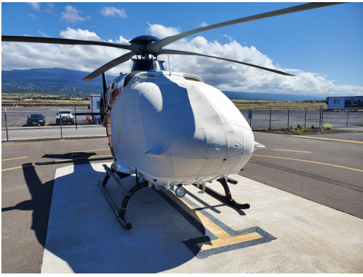
Eurocopter EC135 Bubble Cover