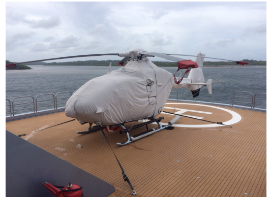
Eurocopter EC-135 Full Body Covers