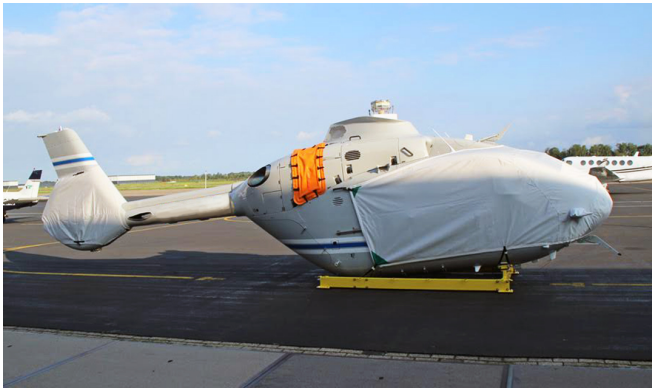
Bubble Cover and Tailfan Cover

The Tailboom Cover details vary by model, but generally the helicopter tail boom cover encloses the tail boom from the "bottleneck" to the aft end. They usually also cover the horizontal stabilizers, and are custom made to allow for antennae, lights, and other protrusions. They attach with straps underneath the tail boom. Covers for the vertical and horizontal stabilizers are also available separately. Specific information for each model is available on request.