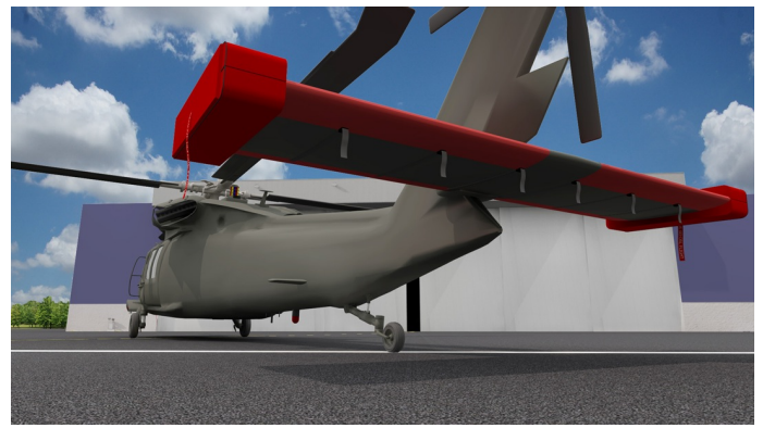
Padded Horizontal Stab Covers, Wingtip Pads (illustration)