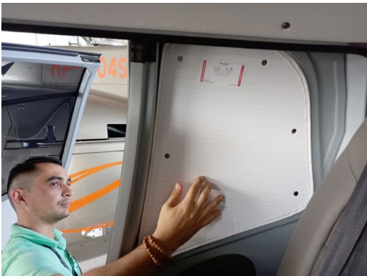
Airbus Helicopter EC130 B4 Side Window Heatshields