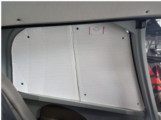
Airbus Helicopter EC130 B4 Side Window Heatshields

Heatshields are interior sunshades for an aircraft's windows or canopy glass. The product is a unique composite of closed-cell foam with a silver mylar finish. The semi-rigid design is stiff enough to stand along the inside of the windshield using sun visors or window framing. It folds up flat and easily stores in the included storage sleeve. Some designs may require velcro and suction cups. A Heatshield is an excellent short-term remedy for cockpit overheating.