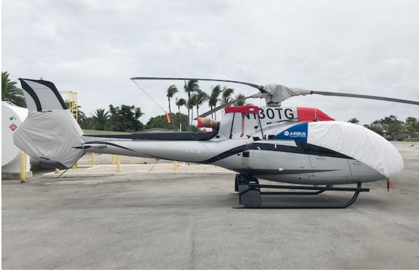
AIRBUS H130 T2, Intake, Exhaust & Tailfan Covers

tight at the blade root with straps and quick-release plastic buckles. The Cold Weather Blade Covers are fitted with full-length zippers and optional deice “boots” designed to accept a preheater hose; a small opening at the tip of the cover allows for some air circulation and drainage in freezing weather. Some part numbers have features for an extra charge.