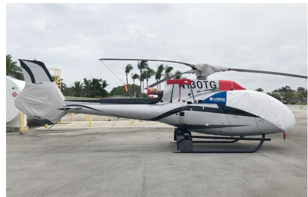
AIRBUS H130 T2, Intake, Exhaust & Tailfan Covers