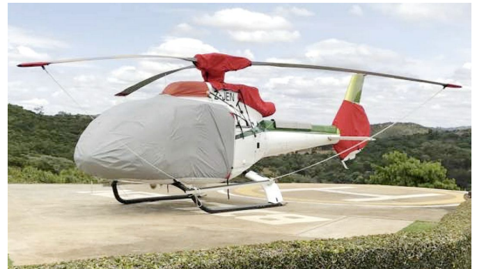
EC130 Bubble, Intake, Exhaust, Rotor Hub & Tailfan Covers