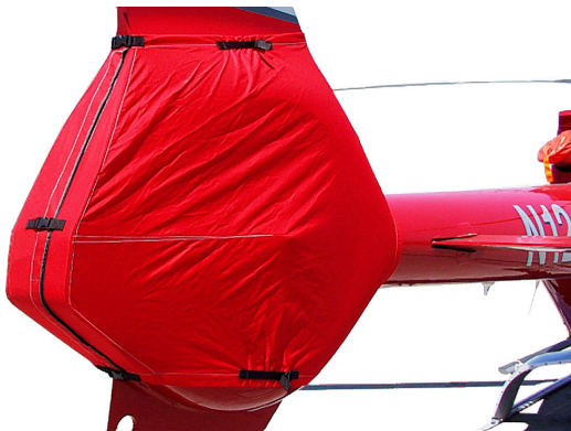
Eurocopter EC-120 Tailfan Cover

The Tailboom Cover details vary by model, but generally the helicopter tail boom cover encloses the tail boom from the "bottleneck" to the aft end. They usually also cover the horizontal stabilizers, and are custom made to allow for antennae, lights, and other protrusions. They attach with straps underneath the tail boom. Covers for the vertical and horizontal stabilizers are also available separately. Specific information for each model is available on request.