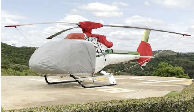
EC130 Bubble, Intake, Exhaust, Rotor Hub & Tailfan Covers

This cover type is made from Silver Acrylic Sunbrella canvas and is 100% lined with a soft and smooth microfiber. Bruce's Custom Covers developed this material combination especially for aircraft protection. The outer material is medium weight and treated for water resistance, UV resistance and anti-static buildup. The inner lining is a very soft and smooth microfiber to prevent scratching. The material is very reflective, and tests show that the cabin interior temperature can be reduced to near-ambient temperature on the hottest of days. It is water, ice and snow repellent, yet breathable to allow moisture to escape from between the cover and the aircraft surface.