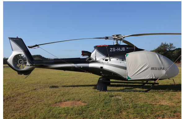
EC-130 Bubble Cover