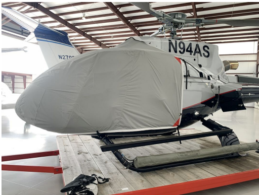
Airbus H-130 Bubble Cover, Travel Weight

This cover type is made from Silver Acrylic Sunbrella canvas and is 100% lined with a soft and smooth microfiber. Bruce's Custom Covers developed this material combination especially for aircraft protection. The outer material is medium weight and treated for water resistance, UV resistance and anti-static buildup. The inner lining is a very soft and smooth microfiber to prevent scratching. The material is very reflective, and tests show that the cabin interior temperature can be reduced to near-ambient temperature on the hottest of days. It is water, ice and snow repellent, yet breathable to allow moisture to escape from between the cover and the aircraft surface.