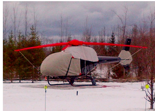
EC-130 Bubble, Engine, Rotor Hub, Blade & Tailfan Covers