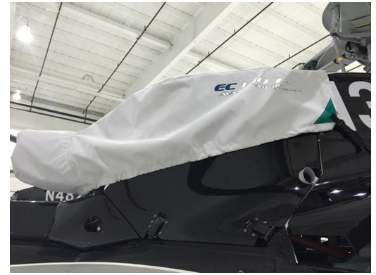
EC-130 Engine Area/Exhaust Cover