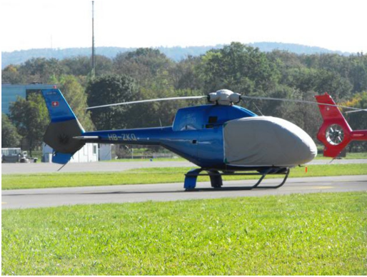
EC-130 Bubble, Tailfan, and Rotor Hub Cover

This cover type is made from Silver Acrylic Sunbrella canvas and is 100% lined with a soft and smooth microfiber. Bruce's Custom Covers developed this material combination especially for aircraft protection. The outer material is medium weight and treated for water resistance, UV resistance and anti-static buildup. The inner lining is a very soft and smooth microfiber to prevent scratching. The material is very reflective, and tests show that the cabin interior temperature can be reduced to near-ambient temperature on the hottest of days. It is water, ice and snow repellent, yet breathable to allow moisture to escape from between the cover and the aircraft surface.