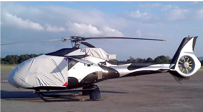
Bubble Cover and Intake/Exhaust Cover

This cover type is made from Silver Acrylic Sunbrella canvas and is 100% lined with a soft and smooth microfiber. Bruce's Custom Covers developed this material combination especially for aircraft protection. The outer material is medium weight and treated for water resistance, UV resistance and anti-static buildup. The inner lining is a very soft and smooth microfiber to prevent scratching. The material is very reflective, and tests show that the cabin interior temperature can be reduced to near-ambient temperature on the hottest of days. It is water, ice and snow repellent, yet breathable to allow moisture to escape from between the cover and the aircraft surface.