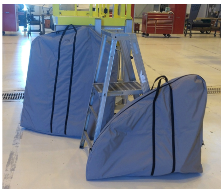
Eurocopter EC-145 Padded Bags for Removable Doors

**Padded Door Bags* are designed to provide portable protection of the doors when they are removed from the aircraft. They are padded to moderate thickness, zippered closed, and have sturdy carry handles for easy transport.