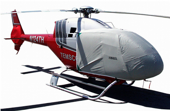
Eurocopter EC-120 Bubble Cover & Tailfan Cover