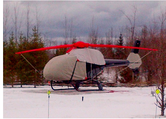
EC-130 Bubble, Engine, Rotor Hub, Blade & Tailfan Covers