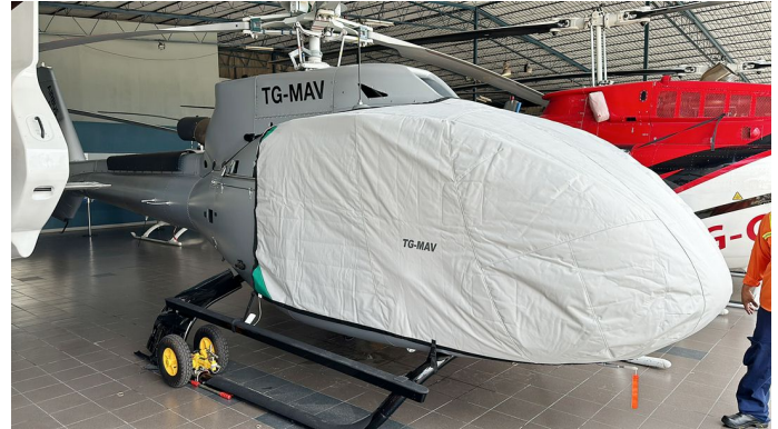
Airbus H-130 Insulated Bubble Cover