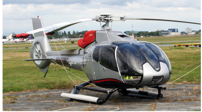
Intake/Exhaust Cover, Rotor Hub Cover (w/ skirt) & Blade Tie Downs