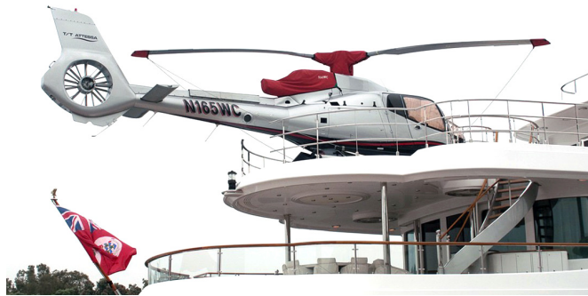
Intake/Exhaust Cover, Rotor Hub Cover (w/ skirt) & Blade Tie Downs