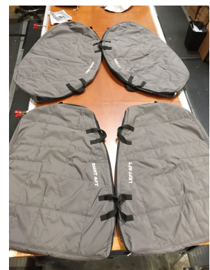
MD 500D Padded Door Bags