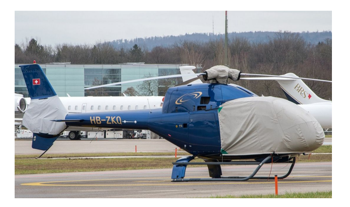
Eurocopter EC-120 Bubble, Rotor Mast & Tailfan Covers