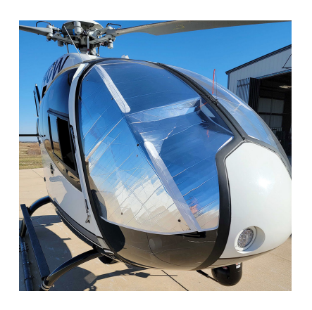
Eurocopter EC-120 Windshield HeatShields