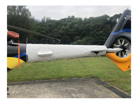
Eurocopter EC-120B Tailboom Cover