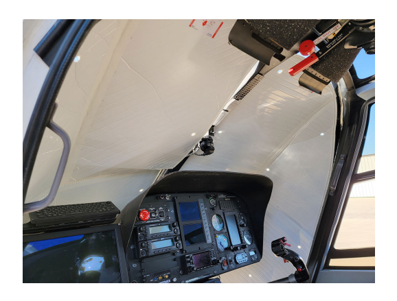
Eurocopter EC-120 Windshield HeatShields

Heatshields are interior sunshades for an aircraft's windows or canopy glass. The product is a unique composite of closed-cell foam with a silver mylar finish. The semi-rigid design is stiff enough to stand along the inside of the windshield using sun visors or window framing. It folds up flat and easily stores in the included storage sleeve. Some designs may require velcro and suction cups. A Heatshield is an excellent short-term remedy for cockpit overheating.