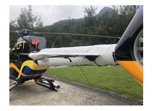
Eurocopter EC-120B Tailboom Cover

The Tailboom Cover details vary by model, but generally the helicopter tail boom cover encloses the tail boom from the "bottleneck" to the aft end. They usually also cover the horizontal stabilizers, and are custom made to allow for antennae, lights, and other protrusions. They attach with straps underneath the tail boom. Covers for the vertical and horizontal stabilizers are also available separately. Specific information for each model is available on request.