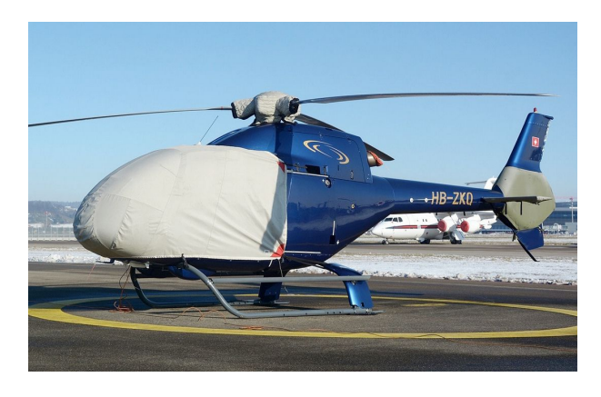
Eurocopter EC-120 Bubble, Rotor Mast & Tailfan Covers