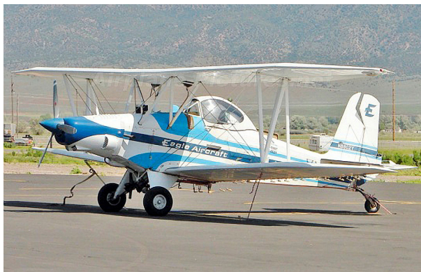
Covers for the Eagle DW-1