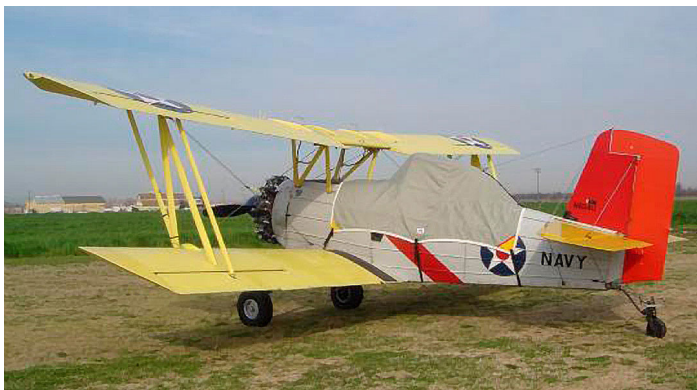
Grumman Ag Cat Canopy Cover