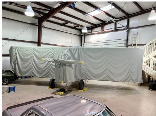
Stearman PT-13 Full Body Dust Cover

Some high value aircraft end up logging lots of hangar time, and become dust magnets in the process. A high quality, well fitting dust cover provides easy assurance that the aircraft's surfaces remain clean and free of grit and grime. Available in a large variety of colors, each dust cover is custom made according to aircraft details and customer preferences. Fire retardant fabrics are also available.