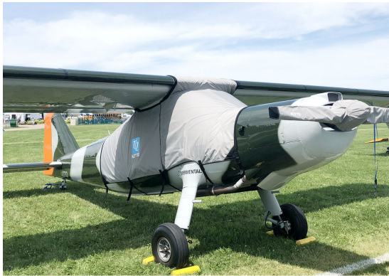
Dornier DO-27 Canopy Cover, Prop Cover

This cover type is made from Silver Acrylic Sunbrella canvas and is 100% lined with a soft and smooth microfiber. Bruce's Custom Covers developed this material combination especially for aircraft protection. The outer material is medium weight and treated for water resistance, UV resistance and anti-static buildup. The inner lining is a very soft and smooth microfiber to prevent scratching. The material is very reflective, and tests show that the cabin interior temperature can be reduced to near-ambient temperature on the hottest of days. It is water, ice and snow repellent, yet breathable to allow moisture to escape from between the cover and the aircraft surface.