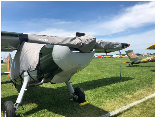
Dornier DO-27 Canopy Cover, Prop Cover