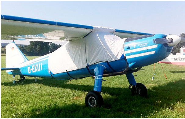
Dornier Do27 Canopy Cover, over-top type