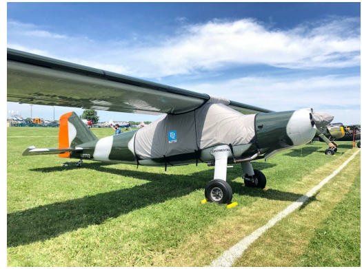
Dornier DO-27 Canopy Cover, Prop Cover