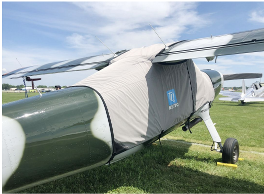
Dornier DO-27 Canopy Cover