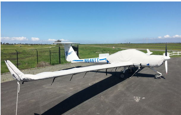
Dimona/Diamond HK36 Extreme Canopy/Engine, Wing Covers