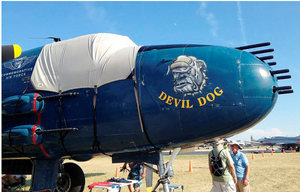
Mitchell B25 Cockpit Cover w/ Custom Imprint (Bellystrap Type)

This cover type is made from Silver Acrylic Sunbrella canvas and is 100% lined with a soft and smooth microfiber. Bruce's Custom Covers developed this material combination especially for aircraft protection. The outer material is medium weight and treated for water resistance, UV resistance and anti-static buildup. The inner lining is a very soft and smooth microfiber to prevent scratching. The material is very reflective, and tests show that the cabin interior temperature can be reduced to near-ambient temperature on the hottest of days. It is water, ice and snow repellent, yet breathable to allow moisture to escape from between the cover and the aircraft surface.