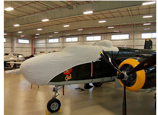
B25 Cockpit/Nose and Gun Turret Covers