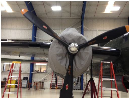
B25 Engine Cover

Engine Covers will cinch around or behind the spinner, cover the entire engine cowl area including the engine air cooling and induction air inlets, and fastens together with Velcro beneath the spinner down the front of the cowling. The Engine Cover is attached with a belly strap aft of the firewall, and can Velcro to the Canopy Cover. Engine Covers are normally made from Solution-Dyed Polyester or Acrylic Sunbrella . An Insulated version of the engine cover can be made with a thicker, quilted, and water-repellent material. The Insulated Engine Cover works well in cold climates to help with engine preheating.