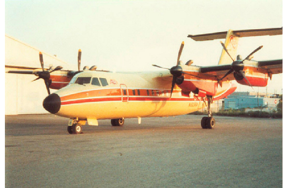
Covers & Plugs for the Dash 7