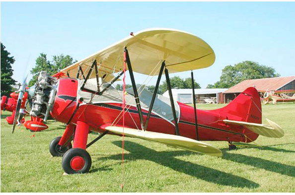
Waco YMF Canopy Cover