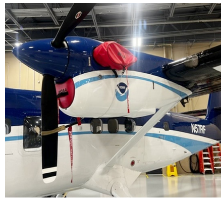
DeHavilland Twin Otter DHC6 Intake Plug, Exhaust Covers