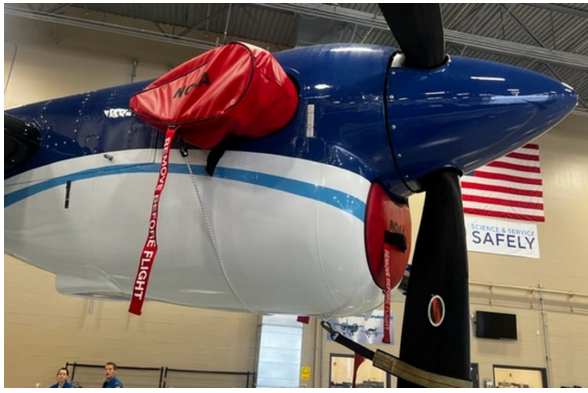
DeHavilland Twin Otter DHC6 Intake Plug, Exhaust Covers