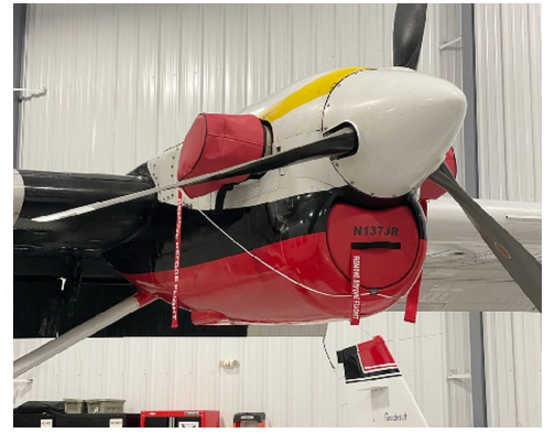
DeHavilland DH-6 Intake Plugs, Exhaust Covers