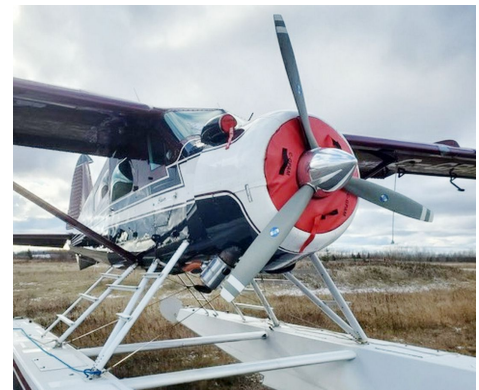
DeHavilland DH2 Beaver Engine Plugs