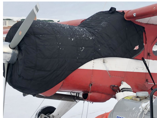
DeHavilland Beaver DHC-2, U-6A, U-6B Insulated Windshield/Engine Cover