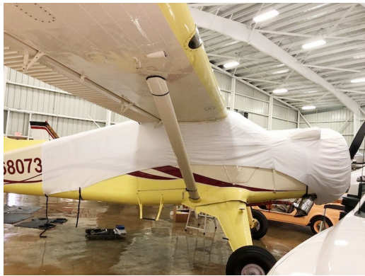
De Havilland Beaver Canopy/Engine Cover, test fit cover

This cover type is made from Silver Acrylic Sunbrella canvas and is 100% lined with a soft and smooth microfiber. Bruce's Custom Covers developed this material combination especially for aircraft protection. The outer material is medium weight and treated for water resistance, UV resistance and anti-static buildup. The inner lining is a very soft and smooth microfiber to prevent scratching. The material is very reflective, and tests show that the cabin interior temperature can be reduced to near-ambient temperature on the hottest of days. It is water, ice and snow repellent, yet breathable to allow moisture to escape from between the cover and the aircraft surface.