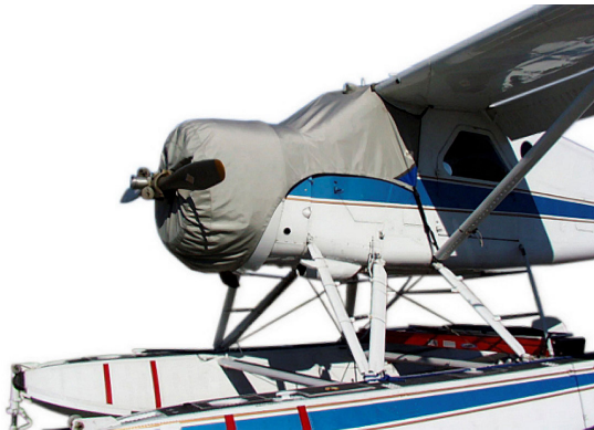
Beaver Windshield/Engine Cover