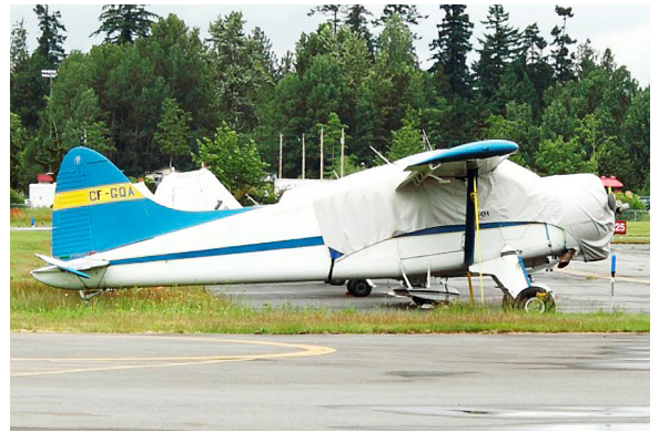
Beaver Canopy/Engine Cover