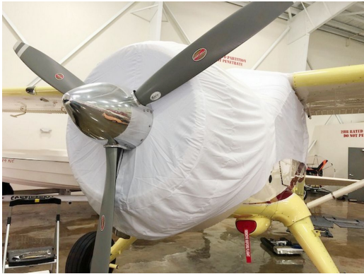
De Havilland Beaver Canopy/Engine Cover, test fit cover