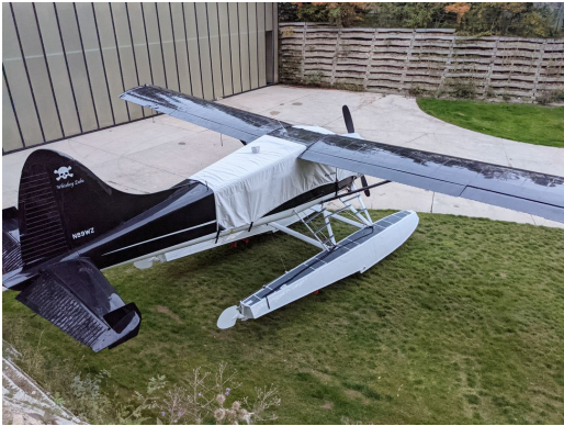
Beaver DHC2 MK1 Canopy/Engine Cover

This cover type is made from Silver Acrylic Sunbrella canvas and is 100% lined with a soft and smooth microfiber. Bruce's Custom Covers developed this material combination especially for aircraft protection. The outer material is medium weight and treated for water resistance, UV resistance and anti-static buildup. The inner lining is a very soft and smooth microfiber to prevent scratching. The material is very reflective, and tests show that the cabin interior temperature can be reduced to near-ambient temperature on the hottest of days. It is water, ice and snow repellent, yet breathable to allow moisture to escape from between the cover and the aircraft surface.