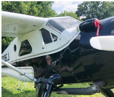
DeHavilland DH-2 Upper Cowling Air Scoop Plug

Engine Inlet Plugs are custom fit for your DeHavilland Beaver DHC-2, U-6A, U-6B intakes, made with heavy-duty vinyl material, and stuffed with a single block of sculpted urethane foam. Each plug has a zipper that allows the foam to be removed and dried if necessary. Engine plugs have warning flags that are visible from the cockpit or 'remove before flight' streamers sewn onto the face of the plugs. Most plugs are imprinted with the aircraft registration number in black for an extra charge. Storage bag NOT included. Engine plugs may be inserted after flight when the engine is still warm. Engine Inlet Plugs are commonly referred to as Cowl Plugs, Intake Plugs, Cowl Blocks, Engine Blocks, and Engine Bungs.