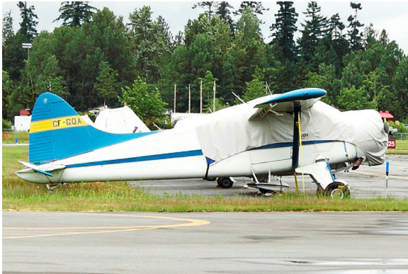
Beaver Canopy/Engine Cover

Travel Covers are made with Silver Solution-Dyed Polyester fabric and only lined over the windshield to save weight. The material is lightweight and more compact for easy stowage in the aircraft. The polyester material is water resistant, but only intended for occasional use outside. We also have an ultra lightweight material available for fitted hangar dust covers. For daily outdoor use, the non-travel Sunbrella Cover is the best choice.