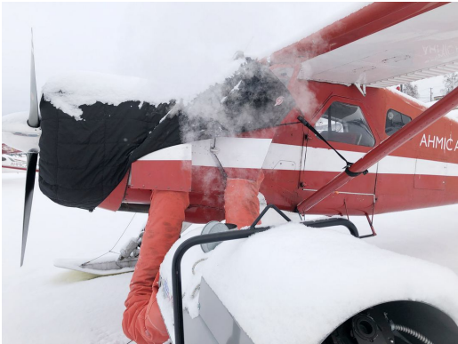
DeHavilland DH-2 Beaver Insulated Engine Cover DeHavilland Beaver DHC-2, U-6A, U-6B Insulated Windshield/Engine Cover