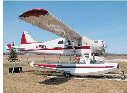
Beaver Windshield/Engine Cover