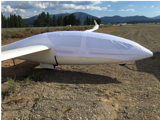
DGF 1000 Canopy/Nose with Turtledeck Extension (test fit cover)