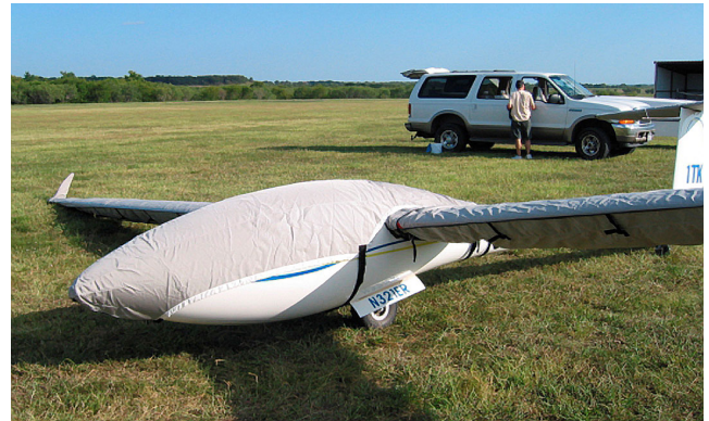
Sailplane Full Cover Set Graphic Indicators (Discus 2B, 3D model)