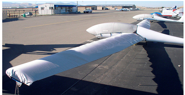
Sailplane Full Cover Set Graphic Indicators (Discus 2B, 3D model)