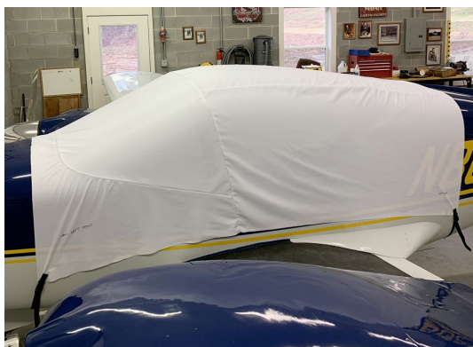
Wing Derringer Canopy Cover, test fit

This cover type is made from Silver Acrylic Sunbrella canvas and is 100% lined with a soft and smooth microfiber. Bruce's Custom Covers developed this material combination especially for aircraft protection. The outer material is medium weight and treated for water resistance, UV resistance and anti-static buildup. The inner lining is a very soft and smooth microfiber to prevent scratching. The material is very reflective, and tests show that the cabin interior temperature can be reduced to near-ambient temperature on the hottest of days. It is water, ice and snow repellent, yet breathable to allow moisture to escape from between the cover and the aircraft surface.