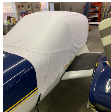
Wing Derringer Canopy Cover, test fit