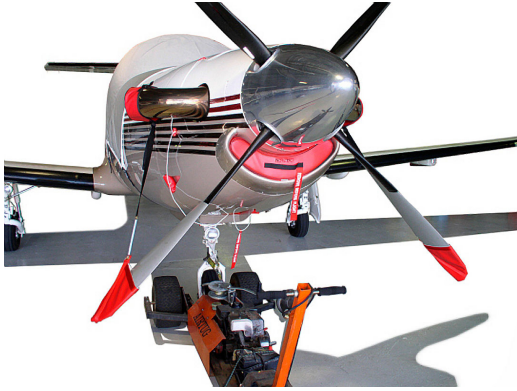
Pilatus PC-12 LARGE ENGINE INLET PLUG, SMALL PLUGS SET, Prop Tie/Exhaust Covers

Engine Inlet Plugs are custom fit for your Beech Denali 220 intakes, made with heavy-duty vinyl material, and stuffed with a single block of sculpted urethane foam. Each plug has a zipper that allows the foam to be removed and dried if necessary. Engine plugs have warning flags that are visible from the cockpit or 'remove before flight' streamers sewn onto the face of the plugs. Most plugs are imprinted with the aircraft registration number in black for an extra charge. Storage bag NOT included. Engine plugs may be inserted after flight when the engine is still warm. Engine Inlet Plugs are commonly referred to as Cowl Plugs, Intake Plugs, Cowl Blocks, Engine Blocks, and Engine Bungs.