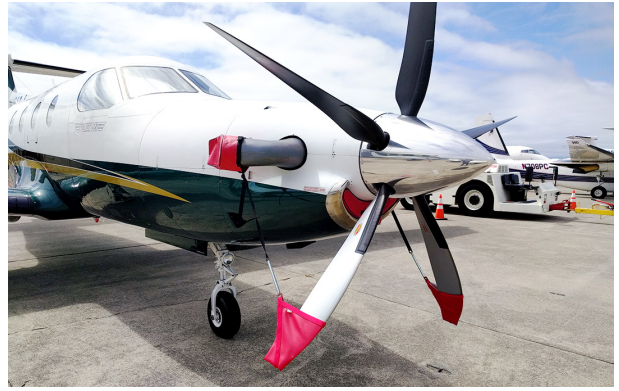
Main Intake Plug and Prop-Tie/Exhaust Covers. (Sold Separately)