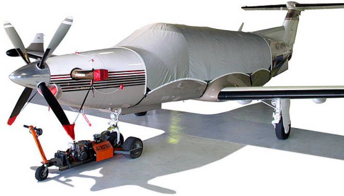
PC-12 Canopy Cover, Engine Plugs, Prop Tie/Exhaust Covers

This cover type is made from Silver Acrylic Sunbrella canvas and is 100% lined with a soft and smooth microfiber. Bruce's Custom Covers developed this material combination especially for aircraft protection. The outer material is medium weight and treated for water resistance, UV resistance and anti-static buildup. The inner lining is a very soft and smooth microfiber to prevent scratching. The material is very reflective, and tests show that the cabin interior temperature can be reduced to near-ambient temperature on the hottest of days. It is water, ice and snow repellent, yet breathable to allow moisture to escape from between the cover and the aircraft surface.