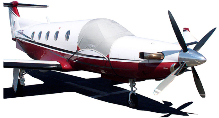
PC-12 Windshield Cover