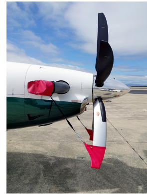
Pilatus PC-12 Prop Tie-Down/Exhaust Cover Set, 5 Blade