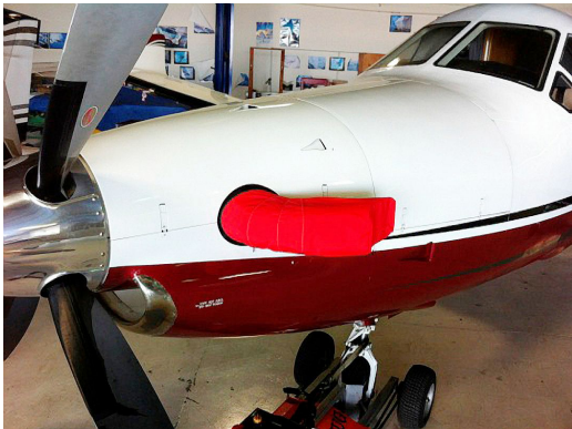
Socata TBM Insulated 5-Blade Prop/Spinner Cover Pilatus PC-12 Exhaust Cover, Fully Enclosed, for protection against corrosion.