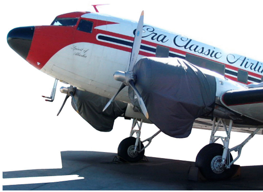
Engine Covers are available in either standard or insulated designs.