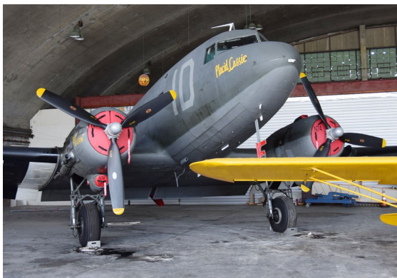
Douglas DC-3 Engine & Oil Cooler Plugs

Engine Inlet Plugs are custom fit for your Douglas DC-3 intakes, made with heavy-duty vinyl material, and stuffed with a single block of sculpted urethane foam. Each plug has a zipper that allows the foam to be removed and dried if necessary. Engine plugs have warning flags that are visible from the cockpit or 'remove before flight' streamers sewn onto the face of the plugs. Most plugs are imprinted with the aircraft registration number in black for an extra charge. Storage bag NOT included. Engine plugs may be inserted after flight when the engine is still warm. Engine Inlet Plugs are commonly referred to as Cowl Plugs, Intake Plugs, Cowl Blocks, Engine Blocks, and Engine Bungs.