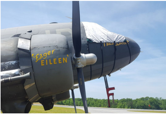
Douglas DC-3 Cockpit Cover