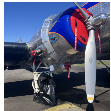
DC-3 Engine Plugs, Tire Covers