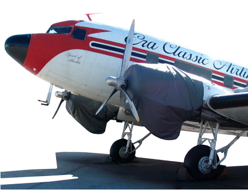
Engine Covers are available in either standard or insulated designs.