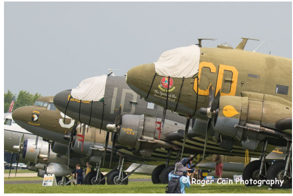
Douglas DC-3's with Cockpit Covers