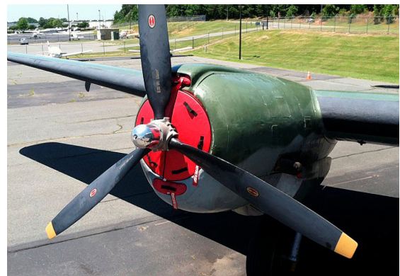
C-46 Radial Engine Intake Plug