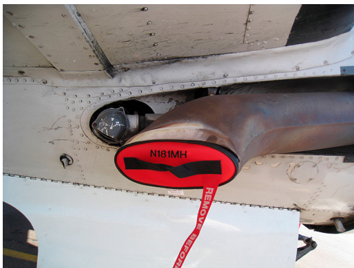
Beech 18 Exhaust Plugs

Engine Inlet Plugs are custom fit for your Douglas DC-3 intakes, made with heavy-duty vinyl material, and stuffed with a single block of sculpted urethane foam. Each plug has a zipper that allows the foam to be removed and dried if necessary. Engine plugs have warning flags that are visible from the cockpit or 'remove before flight' streamers sewn onto the face of the plugs. Most plugs are imprinted with the aircraft registration number in black for an extra charge. Storage bag NOT included. Engine plugs may be inserted after flight when the engine is still warm. Engine Inlet Plugs are commonly referred to as Cowl Plugs, Intake Plugs, Cowl Blocks, Engine Blocks, and Engine Bungs.