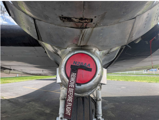
Douglas DC-3 Engine Plugs

Engine Inlet Plugs are custom fit for your Douglas DC-3 intakes, made with heavy-duty vinyl material, and stuffed with a single block of sculpted urethane foam. Each plug has a zipper that allows the foam to be removed and dried if necessary. Engine plugs have warning flags that are visible from the cockpit or 'remove before flight' streamers sewn onto the face of the plugs. Most plugs are imprinted with the aircraft registration number in black for an extra charge. Storage bag NOT included. Engine plugs may be inserted after flight when the engine is still warm. Engine Inlet Plugs are commonly referred to as Cowl Plugs, Intake Plugs, Cowl Blocks, Engine Blocks, and Engine Bungs.