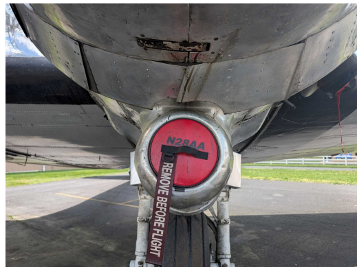
Douglas DC-3 Engine Plugs