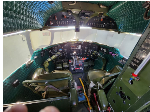
DC-3C Cockpit Heatshields