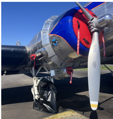
DC-3 Engine Plugs, Tire Covers