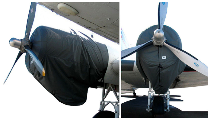
DC3 Engine Covers are custom made for various engine mod's.