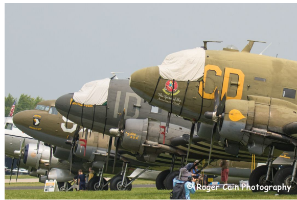
Douglas DC-3's with Cockpit Covers