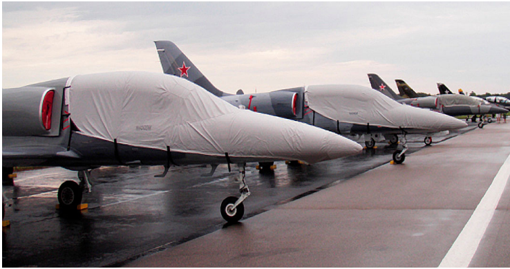
L-39 Canopy/Nose Covers & Plugs

This cover type is made from Silver Acrylic Sunbrella canvas and is 100% lined with a soft and smooth microfiber. Bruce's Custom Covers developed this material combination especially for aircraft protection. The outer material is medium weight and treated for water resistance, UV resistance and anti-static buildup. The inner lining is a very soft and smooth microfiber to prevent scratching. The material is very reflective, and tests show that the cabin interior temperature can be reduced to near-ambient temperature on the hottest of days. It is water, ice and snow repellent, yet breathable to allow moisture to escape from between the cover and the aircraft surface.