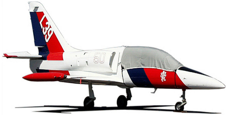
Canopy Cover for Aero L-39 Albatros