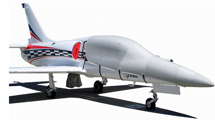
L39 Canopy/Nose Cover & Intake Plugs

This cover type is made from Silver Acrylic Sunbrella canvas and is 100% lined with a soft and smooth microfiber. Bruce's Custom Covers developed this material combination especially for aircraft protection. The outer material is medium weight and treated for water resistance, UV resistance and anti-static buildup. The inner lining is a very soft and smooth microfiber to prevent scratching. The material is very reflective, and tests show that the cabin interior temperature can be reduced to near-ambient temperature on the hottest of days. It is water, ice and snow repellent, yet breathable to allow moisture to escape from between the cover and the aircraft surface.