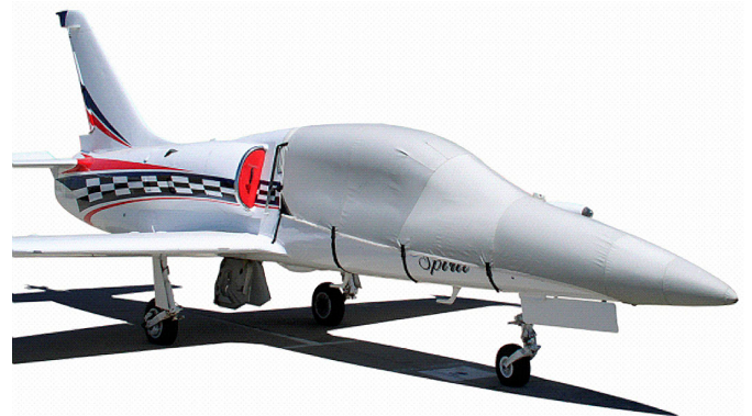
L39 Canopy/Nose Cover & Intake Plugs