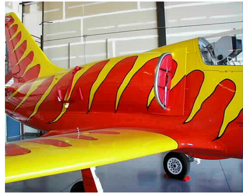
Inlet Plug, folding type