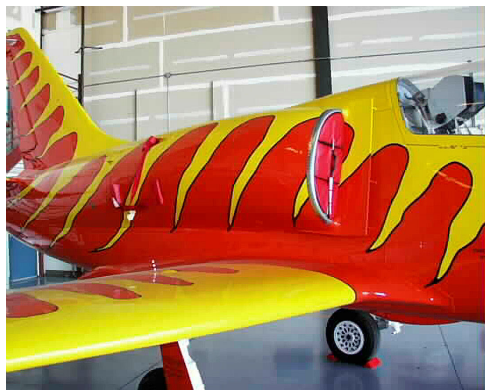
Inlet Plug, folding type