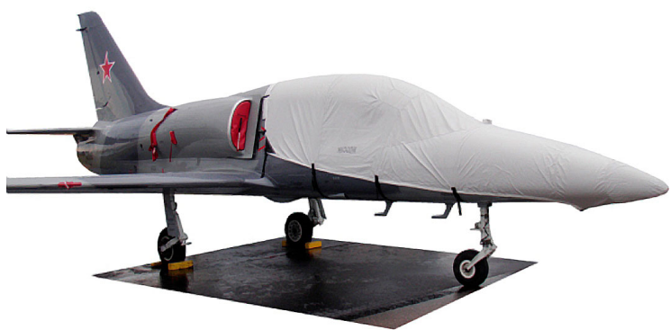
L-39 Canopy/Nose Cover & Plugs