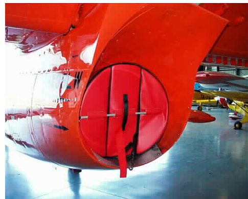
Exhaust Plug, folding type