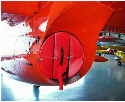
Exhaust Plug, folding type