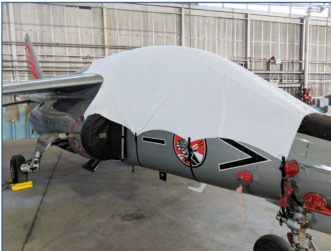
Dornier Alpha Jet Canopy Cover, test fit cover