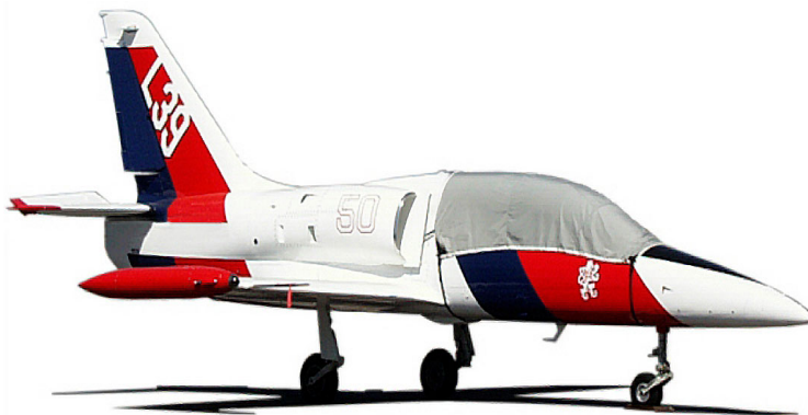
Canopy Cover for Aero L-39 Albatros

Travel Covers are made with Silver Solution-Dyed Polyester fabric and only lined over the windshield to save weight. The material is lightweight and more compact for easy stowage in the aircraft. The polyester material is water resistant, but only intended for occasional use outside. We also have an ultra lightweight material available for fitted hangar dust covers. For daily outdoor use, the non-travel Sunbrella Cover is the best choice.