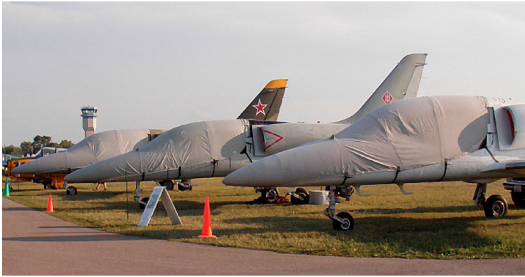
L-39 Canopy/Nose Covers & Plugs

This cover type is made from Silver Acrylic Sunbrella canvas and is 100% lined with a soft and smooth microfiber. Bruce's Custom Covers developed this material combination especially for aircraft protection. The outer material is medium weight and treated for water resistance, UV resistance and anti-static buildup. The inner lining is a very soft and smooth microfiber to prevent scratching. The material is very reflective, and tests show that the cabin interior temperature can be reduced to near-ambient temperature on the hottest of days. It is water, ice and snow repellent, yet breathable to allow moisture to escape from between the cover and the aircraft surface.