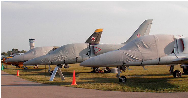
L-39 Canopy/Nose Covers & Plugs

This cover type is made from Silver Acrylic Sunbrella canvas and is 100% lined with a soft and smooth microfiber. Bruce's Custom Covers developed this material combination especially for aircraft protection. The outer material is medium weight and treated for water resistance, UV resistance and anti-static buildup. The inner lining is a very soft and smooth microfiber to prevent scratching. The material is very reflective, and tests show that the cabin interior temperature can be reduced to near-ambient temperature on the hottest of days. It is water, ice and snow repellent, yet breathable to allow moisture to escape from between the cover and the aircraft surface.