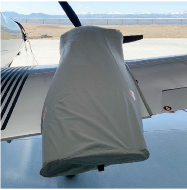
Diamond DA-62 Travel Weight Engine Covers