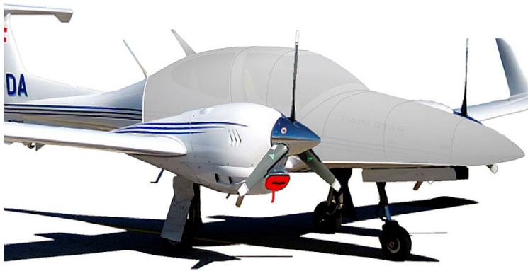
Twinstar Extended Canopy/Nose Cover & Engine Plugs (Illustration)

Engine Inlet Plugs are custom fit for your Diamond DA-62 intakes, made with heavy-duty vinyl material, and stuffed with a single block of sculpted urethane foam. Each plug has a zipper that allows the foam to be removed and dried if necessary. Engine plugs have warning flags that are visible from the cockpit or 'remove before flight' streamers sewn onto the face of the plugs. Most plugs are imprinted with the aircraft registration number in black for an extra charge. Storage bag NOT included. Engine plugs may be inserted after flight when the engine is still warm. Engine Inlet Plugs are commonly referred to as Cowl Plugs, Intake Plugs, Cowl Blocks, Engine Blocks, and Engine Bungs.