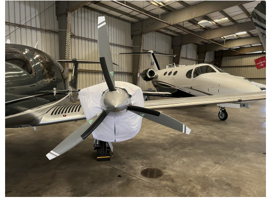
Diamond DA-62 Engine Cover, test fit cover