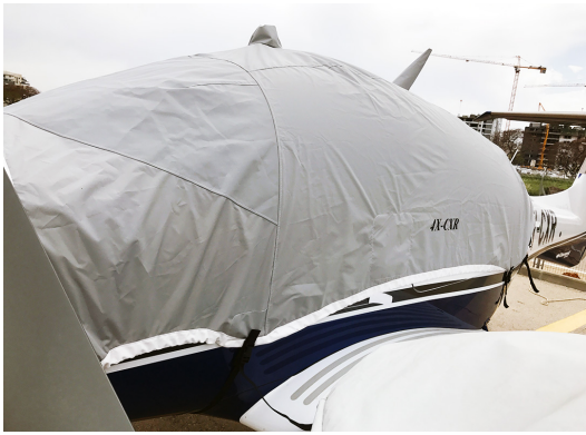
Diamond DA-62 Travel Cover, Light Weight Travel Canopy Cover