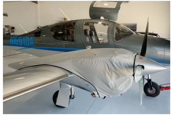
Diamond DA-62 Travel Weight Engine Covers