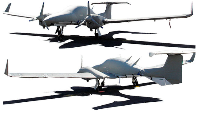
Diamond DA-62 Empennage Cover, 3D model DA-42 Full Cover Set: Extended Canopy/Nose, Wing/Engine, Prop, Empennage