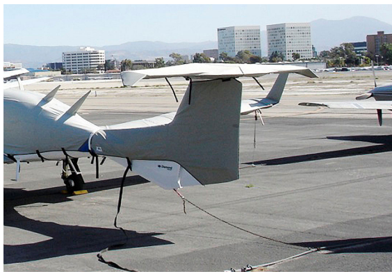
DA-42 Empennage & Horiz. Stab. Covers