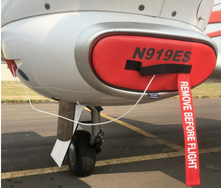
Diamond Da-42 Engine Inlet Plugs Set of 4