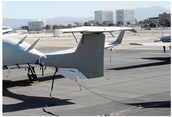
DA-42 Empennage & Horiz. Stab. Covers