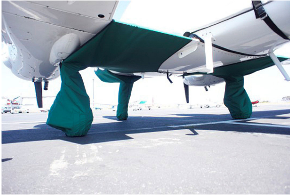
Twinstar Landing Gear &amp; Gearwell Covers