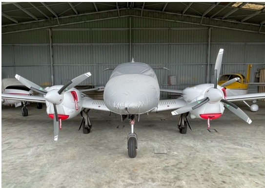
DA-62 Travel Weight Canopy/Nose Cover, Engine Plugs

Engine Inlet Plugs are custom fit for your Diamond DA-62 intakes, made with heavy-duty vinyl material, and stuffed with a single block of sculpted urethane foam. Each plug has a zipper that allows the foam to be removed and dried if necessary. Engine plugs have warning flags that are visible from the cockpit or 'remove before flight' streamers sewn onto the face of the plugs. Most plugs are imprinted with the aircraft registration number in black for an extra charge. Storage bag NOT included. Engine plugs may be inserted after flight when the engine is still warm. Engine Inlet Plugs are commonly referred to as Cowl Plugs, Intake Plugs, Cowl Blocks, Engine Blocks, and Engine Bungs.