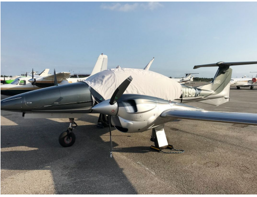
DIAMOND DA-62 CANOPY COVER