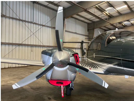
Diamond DA-62 Engine Inlet Plugs

Engine Inlet Plugs are custom fit for your Diamond DA-62 intakes, made with heavy-duty vinyl material, and stuffed with a single block of sculpted urethane foam. Each plug has a zipper that allows the foam to be removed and dried if necessary. Engine plugs have warning flags that are visible from the cockpit or 'remove before flight' streamers sewn onto the face of the plugs. Most plugs are imprinted with the aircraft registration number in black for an extra charge. Storage bag NOT included. Engine plugs may be inserted after flight when the engine is still warm. Engine Inlet Plugs are commonly referred to as Cowl Plugs, Intake Plugs, Cowl Blocks, Engine Blocks, and Engine Bungs.