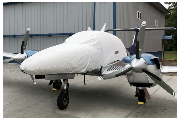
Diamond DA-62 Canopy/Nose Cover