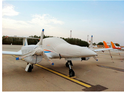
Diamond DA-42NG Canopy/Nose, Engine & Prop Covers