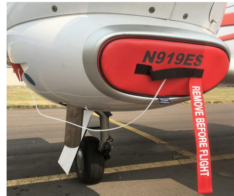
Diamond Da-42 Engine Inlet Plugs Set of 4