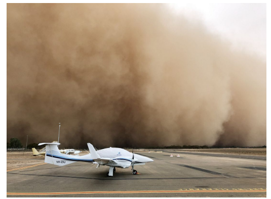
Diamond DA-42 Canopy/Nose Cover