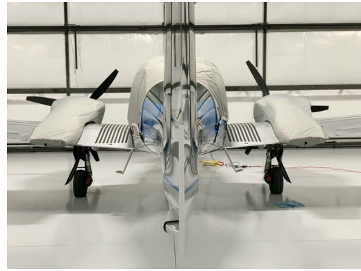
Diamond DA-62 Travel Weight Canopy & Engine Covers