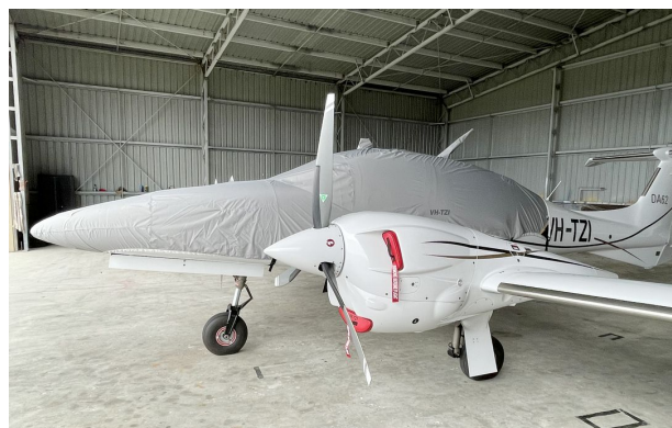
Diamond DA-62 Canopy/Nose Cover, Engine Plugs