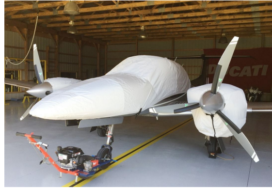
Diamond DA-42-VI Canopy/Nose & Engine Covers