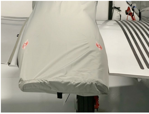
Diamond DA-62 Travel Weight Canopy & Engine Covers