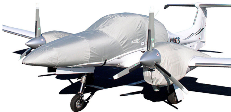
Diamond Twinstar Canopy/Nose Cover & Engine Covers