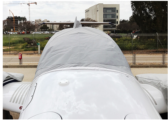
Diamond DA-62 Travel Cover, Light Weight Travel Canopy Cover