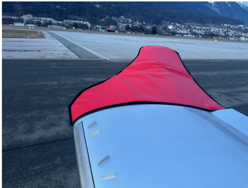
Diamond DA-62 Wingtip Pads

Designed to prevent damage to the aircraft extremities in crowded hangars, these products are made of bright red Naugahyde and thickly padded with a sandwich of closed cell foam. Nowadays they are also made using bright read Neoprene padded laminated (think: wetsuit material).