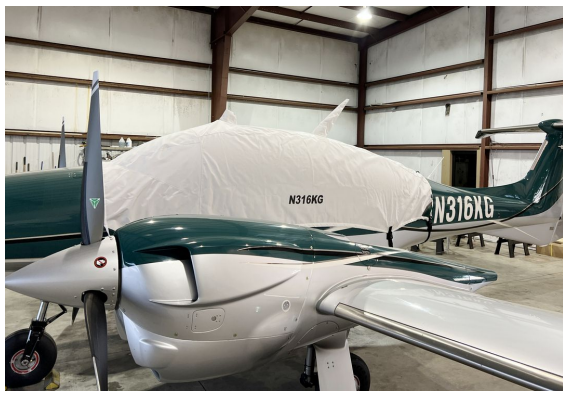
DA-62 Canopy Cover