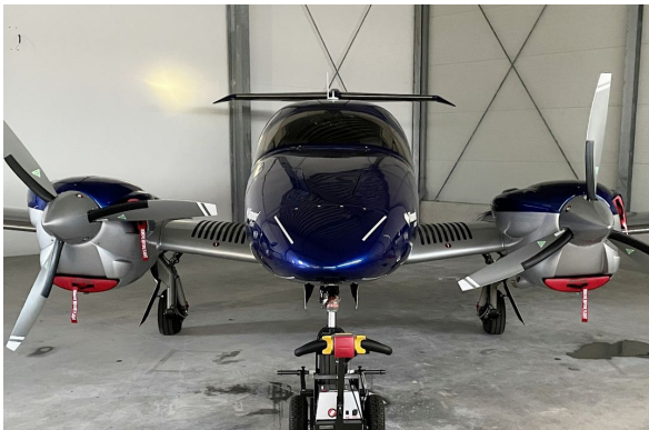
DA-62 engine inlet plugs

Engine Inlet Plugs are custom fit for your Diamond DA-62 intakes, made with heavy-duty vinyl material, and stuffed with a single block of sculpted urethane foam. Each plug has a zipper that allows the foam to be removed and dried if necessary. Engine plugs have warning flags that are visible from the cockpit or 'remove before flight' streamers sewn onto the face of the plugs. Most plugs are imprinted with the aircraft registration number in black for an extra charge. Storage bag NOT included. Engine plugs may be inserted after flight when the engine is still warm. Engine Inlet Plugs are commonly referred to as Cowl Plugs, Intake Plugs, Cowl Blocks, Engine Blocks, and Engine Bungs.