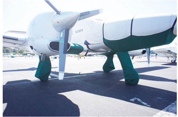
Twinstar Landing Gear &amp; Gearwell Covers