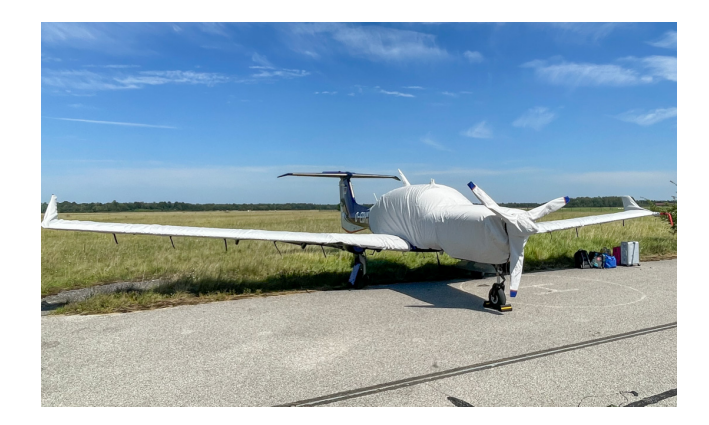
Diamond DA-50 Extended Canopy/Engine Cover, Wing & Prop Covers

This cover type is made from Silver Acrylic Sunbrella canvas and is 100% lined with a soft and smooth microfiber. Bruce's Custom Covers developed this material combination especially for aircraft protection. The outer material is medium weight and treated for water resistance, UV resistance and anti-static buildup. The inner lining is a very soft and smooth microfiber to prevent scratching. The material is very reflective, and tests show that the cabin interior temperature can be reduced to near-ambient temperature on the hottest of days. It is water, ice and snow repellent, yet breathable to allow moisture to escape from between the cover and the aircraft surface.