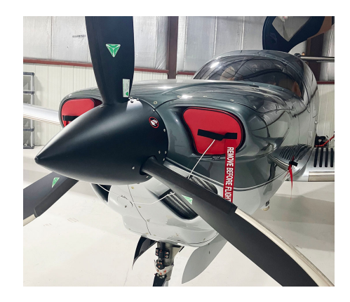
Diamond DA-50 Superstar Engine Inlet Plugs

Engine Inlet Plugs are custom fit for your Diamond DA-50 Superstar intakes, made with heavy-duty vinyl material, and stuffed with a single block of sculpted urethane foam. Each plug has a zipper that allows the foam to be removed and dried if necessary. Engine plugs have warning flags that are visible from the cockpit or 'remove before flight' streamers sewn onto the face of the plugs. Most plugs are imprinted with the aircraft registration number in black for an extra charge. Storage bag NOT included. Engine plugs may be inserted after flight when the engine is still warm. Engine Inlet Plugs are commonly referred to as Cowl Plugs, Intake Plugs, Cowl Blocks, Engine Blocks, and Engine Bungs.