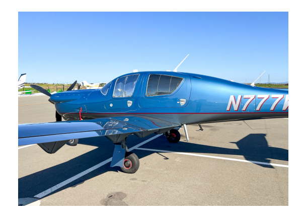
Diamond DA-50 HeatShield Set

Cabin Heatshields are interior sunshades for the aircraft's passenger cabin area. The product is a unique composite of closed-cell foam with a silver mylar finish. The semi-rigid design is stiff enough to stand inside the window framing. The set folds up flat and is easily stored in the included storage sleeve. Some designs may require velcro and suction cups. A Heatshield is an excellent short-term remedy for cockpit overheating, but an external fabric cover is more effective for long-term protection.