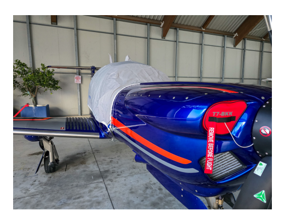
Diamond DA-50 Canopy Cover, Engine Plugs