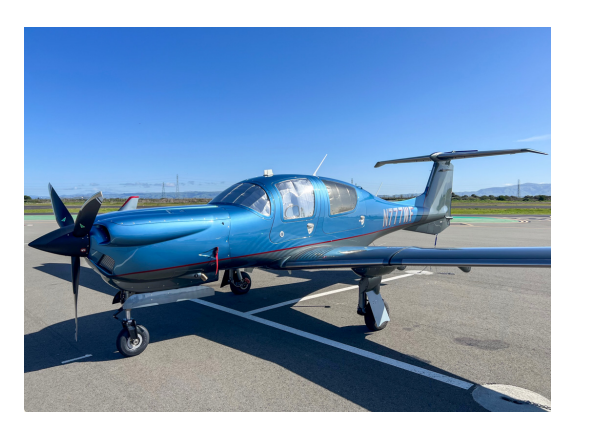
Diamond DA-50 HeatShield Set