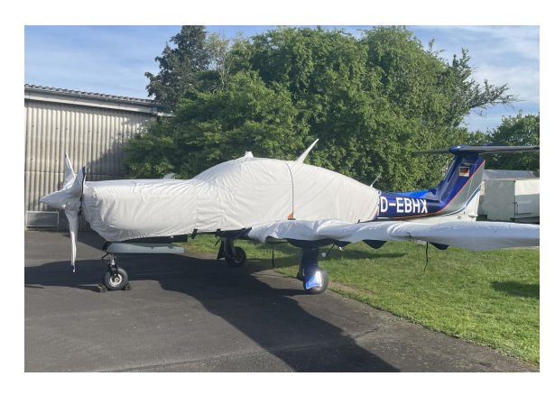
Diamond DA-50 Extended Canopy/Engine, Prop & Wing Covers Diamond DA-50 Extended Canopy/Engine, Prop & Wing Covers (test fit) (test fit)