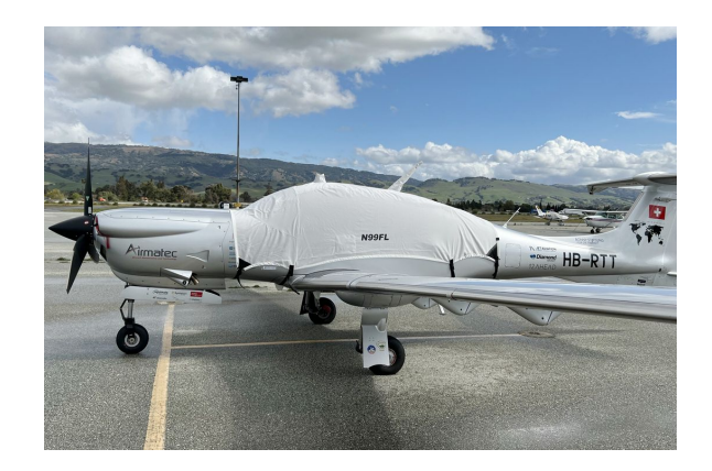
Diamond DA-50 Canopy Cover