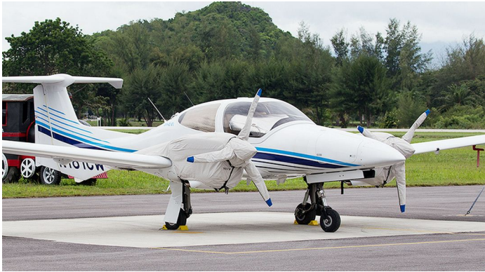
Diamond DA-42NG Engine & Prop Covers