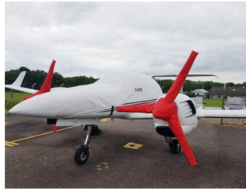
Diamond DA-42 Canopy/Nose and Insulated Prop Covers