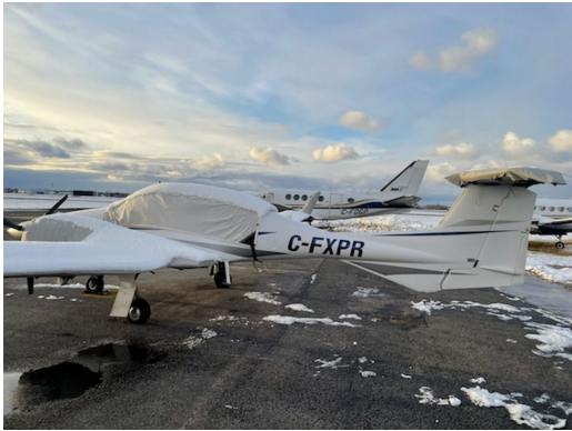
Diamond DA-42 Canopy, Wing, Engine & Horizontal Stabilizer Covers

WINTER USE MATERIAL - Made with Solution-Dyed Polyester fabric, this option is intended for seasonal use to aid in deicing, rain mitigation, or for occasional travel. The material is lighter and more compact, but more susceptible to UV damage and may have a shorter useful life if used continuously outside than the all-year use material.