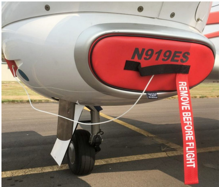
Diamond Da-42 Engine Inlet Plugs Set of 4