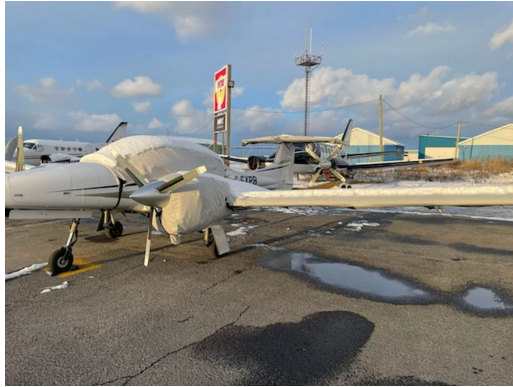
Diamond DA-42 Canopy, Wing, Engine & Horizontal Stabilizer Covers

WINTER USE MATERIAL - Made with Solution-Dyed Polyester fabric, this option is intended for seasonal use to aid in deicing, rain mitigation, or for occasional travel. The material is lighter and more compact, but more susceptible to UV damage and may have a shorter useful life if used continuously outside than the all-year use material.