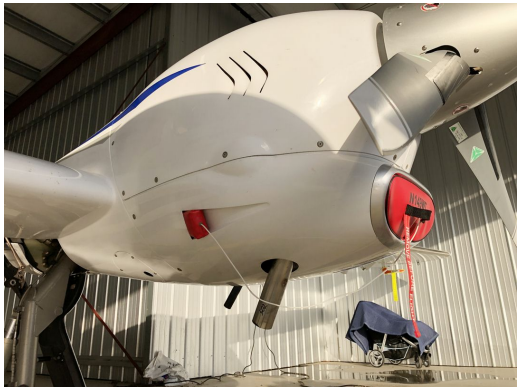
Diamond DA-42 Engine Inlet Plugs

Engine Inlet Plugs are custom fit for your Diamond DA-42 Twin Star intakes, made with heavy-duty vinyl material, and stuffed with a single block of sculpted urethane foam. Each plug has a zipper that allows the foam to be removed and dried if necessary. Engine plugs have warning flags that are visible from the cockpit or 'remove before flight' streamers sewn onto the face of the plugs. Most plugs are imprinted with the aircraft registration number in black for an extra charge. Storage bag NOT included. Engine plugs may be inserted after flight when the engine is still warm. Engine Inlet Plugs are commonly referred to as Cowl Plugs, Intake Plugs, Cowl Blocks, Engine Blocks, and Engine Bungs.