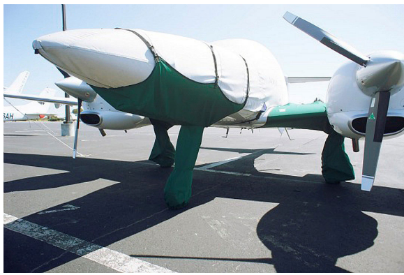
Diamond DA-42 Twinstar Landing Gear & Gearwell Covers