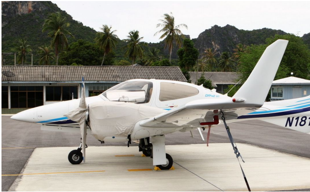
Diamond DA-42NG Engine & Prop Covers

The material is very reflective, and tests show that the cabin interior temperature can be reduced to near-ambient temperature on the hottest of days. It is water, ice and snow repellent, yet breathable to allow moisture to escape from between the cover and the aircraft surface.