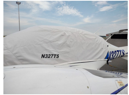
Diamond DA-42 Twin Star Canopy Cover