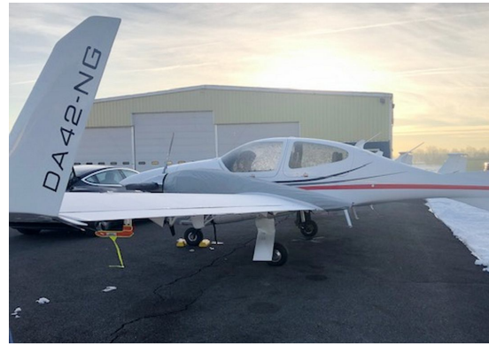
Diamond DA-42 Twin Star Travel Cover, Light Weight Travel Engine Covers, Specify Engine Type