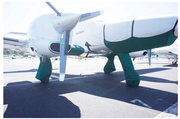
Twinstar Landing Gear & Gearwell Covers