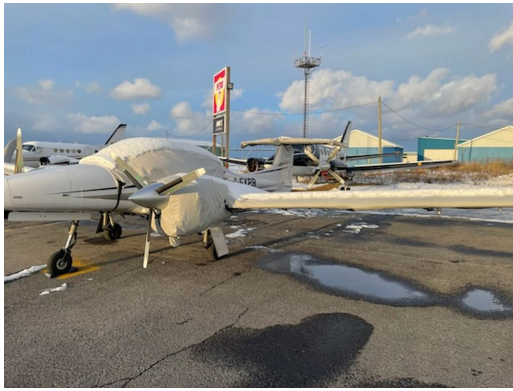
Diamond DA-42 Canopy, Wing, Engine & Horizontal Stabilizer Covers