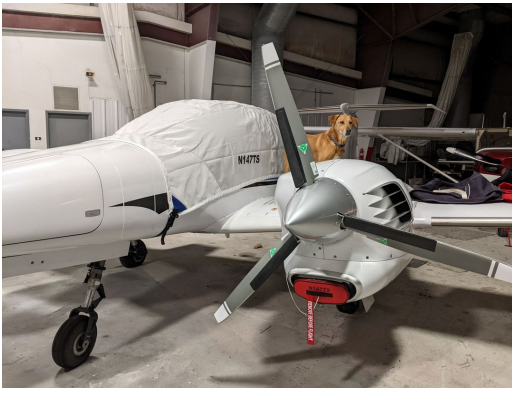
Diamond DA-42 NG Canopy Cover, Engine Plugs