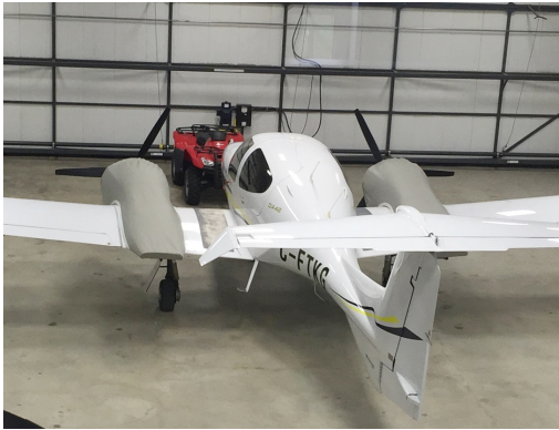
Diamond DA-42 Twinstar Engine Covers

The material is very reflective, and tests show that the cabin interior temperature can be reduced to near-ambient temperature on the hottest of days. It is water, ice and snow repellent, yet breathable to allow moisture to escape from between the cover and the aircraft surface.