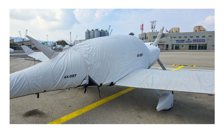
Diamond DA-40 Complete Cover Set