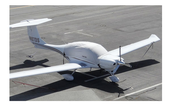
Diamond DA-40 Canopy Cover

This cover type is made from Silver Acrylic Sunbrella canvas and is 100% lined with a soft and smooth microfiber. Bruce's Custom Covers developed this material combination especially for aircraft protection. The outer material is medium weight and treated for water resistance, UV resistance and anti-static buildup. The inner lining is a very soft and smooth microfiber to prevent scratching. The material is very reflective, and tests show that the cabin interior temperature can be reduced to near-ambient temperature on the hottest of days. It is water, ice and snow repellent, yet breathable to allow moisture to escape from between the cover and the aircraft surface.