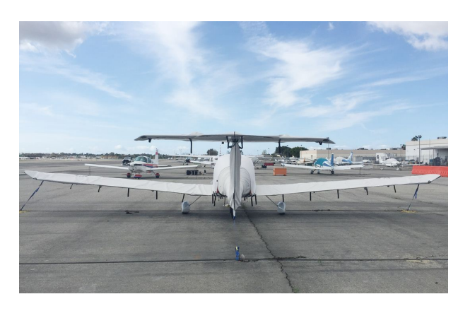
Diamond DA-40 Full Cover Set