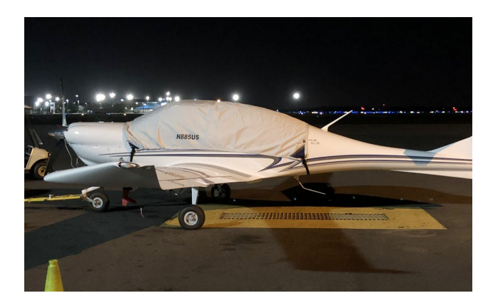
Diamond DA-40 Canopy Cover