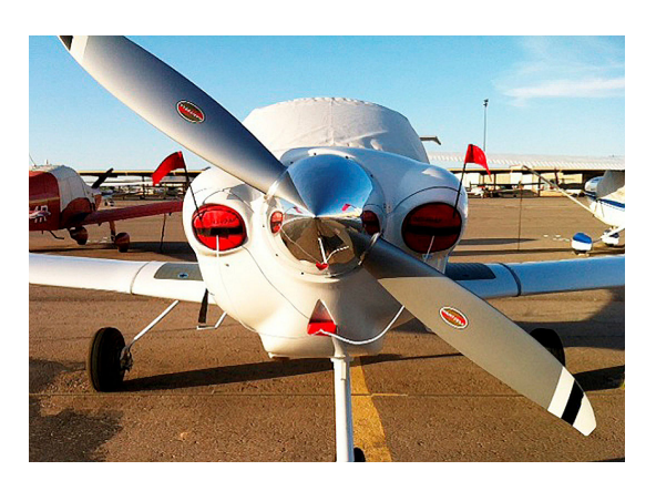
Diamond DA-40 Engine Inlet Plugs (set of 3)