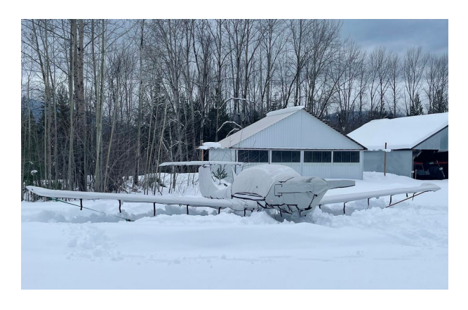
Diamond DA-40 Winter Covers