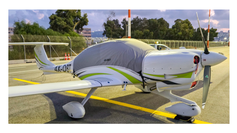
Diamond DA-40 Travel Cover, Light Weight Canopy Cover, Ng Model (Aft Scoop Ext.)