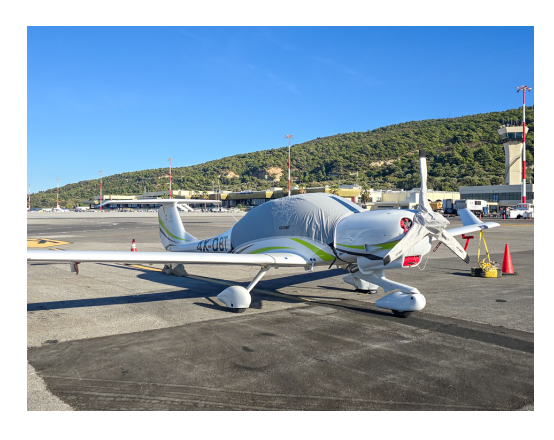
Diamond DA-40 Canopy & Prop Covers, Engine Plugs