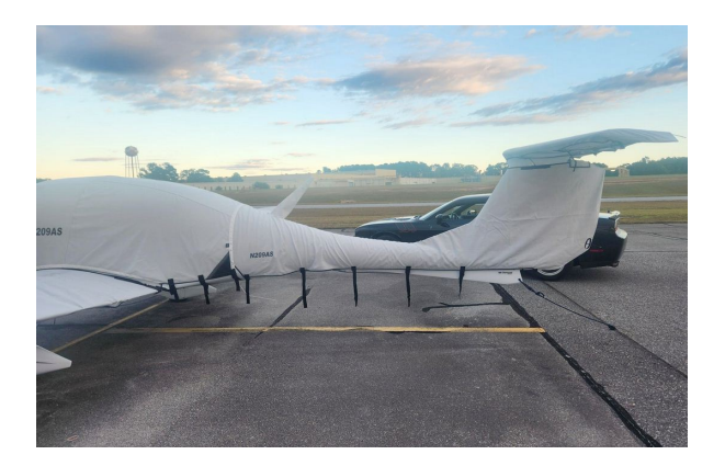
Diamond DA-40 Winter Cover Set

WINTER USE MATERIAL - Made with Solution-Dyed Polyester fabric, this option is intended for seasonal use to aid in deicing, rain mitigation, or for occasional travel. The material is lighter and more compact, but more susceptible to UV damage and may have a shorter useful life if used continuously outside than the all-year use material.