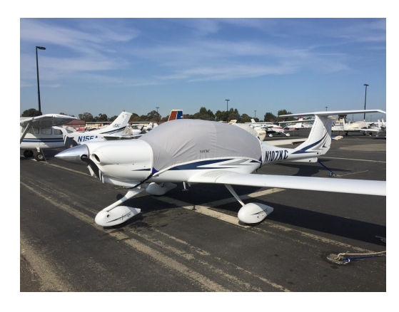
Diamond DA-40 Travel Cover, Light Weight Travel Canopy Cover