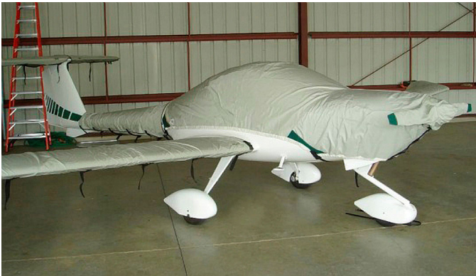
DA-20 Canopy/Engine, Prop/Spinner, Wing, Tailboom, Horiz. Stab. Covers

This cover type is made from Silver Acrylic Sunbrella canvas and is 100% lined with a soft and smooth microfiber. Bruce's Custom Covers developed this material combination especially for aircraft protection. The outer material is medium weight and treated for water resistance, UV resistance and anti-static buildup. The inner lining is a very soft and smooth microfiber to prevent scratching. The material is very reflective, and tests show that the cabin interior temperature can be reduced to near-ambient temperature on the hottest of days. It is water, ice and snow repellent, yet breathable to allow moisture to escape from between the cover and the aircraft surface.