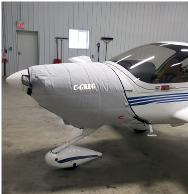
Diamond DA-20-C1 Insulated Engine Cover