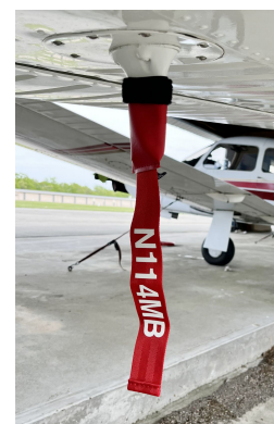
Blade-type Pitot Cover