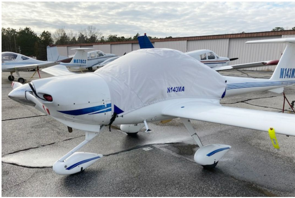
Diamond DA20-C1 Canopy Cover

This cover type is made from Silver Acrylic Sunbrella canvas and is 100% lined with a soft and smooth microfiber. Bruce's Custom Covers developed this material combination especially for aircraft protection. The outer material is medium weight and treated for water resistance, UV resistance and anti-static buildup. The inner lining is a very soft and smooth microfiber to prevent scratching. The material is very reflective, and tests show that the cabin interior temperature can be reduced to near-ambient temperature on the hottest of days. It is water, ice and snow repellent, yet breathable to allow moisture to escape from between the cover and the aircraft surface.