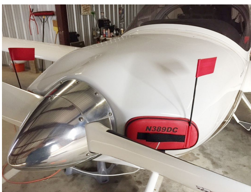
Diamond DA-20-C1 Engine Inlet Plugs

Engine Inlet Plugs are custom fit for your Diamond DA-20, Katana, Eclipse intakes, made with heavy-duty vinyl material, and stuffed with a single block of sculpted urethane foam. Each plug has a zipper that allows the foam to be removed and dried if necessary. Engine plugs have warning flags that are visible from the cockpit or 'remove before flight' streamers sewn onto the face of the plugs. Most plugs are imprinted with the aircraft registration number in black for an extra charge. Storage bag NOT included. Engine plugs may be inserted after flight when the engine is still warm. Engine Inlet Plugs are commonly referred to as Cowl Plugs, Intake Plugs, Cowl Blocks, Engine Blocks, and Engine Bungs.