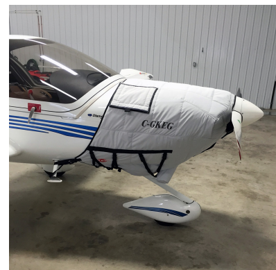
Diamond DA-20-C1 Insulated Engine Cover