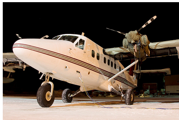
De Havilland Twin Otter Insulated Engine & Insulated Propellor/Spinner Covers Twin Otter Wing, Horiz. Stab & Engine Covers