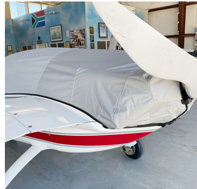
Cozy Mk IV Canopy/Nose/Engine Cover, travel weight design