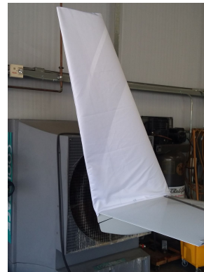
Velocity Vertical Stabilizer Covers, test fit cover