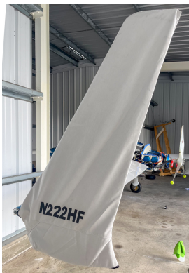
Cozy All Models Vertical Stabilizer Covers, All Year Use

WINTER USE MATERIAL - Made with Solution-Dyed Polyester fabric, this option is intended for seasonal use to aid in deicing, rain mitigation, or for occasional travel. The material is lighter and more compact, but more susceptible to UV damage and may have a shorter useful life if used continuously outside than the all-year use material.