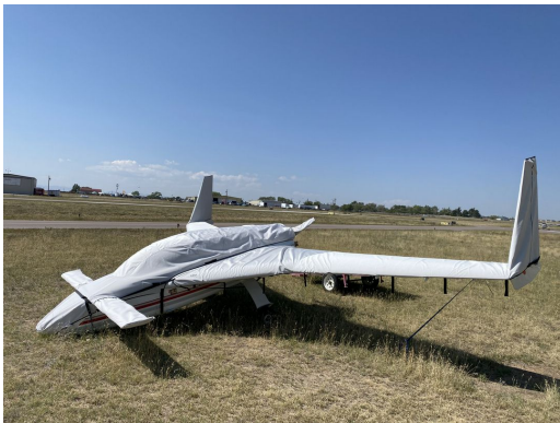
Cozy Mk IV Complete Cover Set

WINTER USE MATERIAL - Made with Solution-Dyed Polyester fabric, this option is intended for seasonal use to aid in deicing, rain mitigation, or for occasional travel. The material is lighter and more compact, but more susceptible to UV damage and may have a shorter useful life if used continuously outside than the all-year use material.