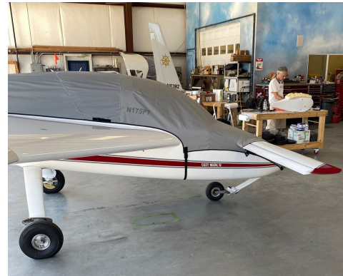
Cozy Mk IV Canopy/Nose/Engine Cover, travel weight design