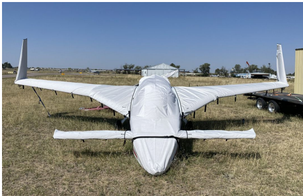
Cozy Mk IV Complete Cover Set

WINTER USE MATERIAL - Made with Solution-Dyed Polyester fabric, this option is intended for seasonal use to aid in deicing, rain mitigation, or for occasional travel. The material is lighter and more compact, but more susceptible to UV damage and may have a shorter useful life if used continuously outside than the all-year use material.