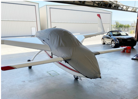
Cozy Mk IV Canopy/Nose/Engine Cover, travel weight design

Travel Covers are made with Silver Solution-Dyed Polyester fabric and only lined over the windshield to save weight. The material is lightweight and more compact for easy stowage in the aircraft. The polyester material is water resistant, but only intended for occasional use outside. We also have an ultra lightweight material available for fitted hangar dust covers. For daily outdoor use, the non-travel Sunbrella Cover is the best choice.