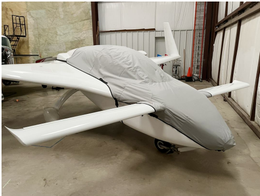
Cozy Mk IV Canopy/Nose Cover, travel weight

Travel Covers are made with Silver Solution-Dyed Polyester fabric and only lined over the windshield to save weight. The material is lightweight and more compact for easy stowage in the aircraft. The polyester material is water resistant, but only intended for occasional use outside. We also have an ultra lightweight material available for fitted hangar dust covers. For daily outdoor use, the non-travel Sunbrella Cover is the best choice.