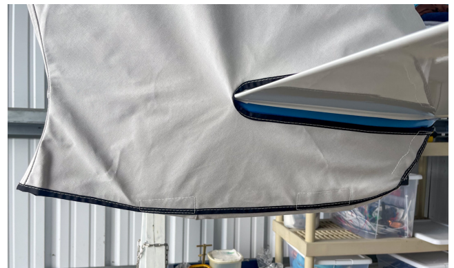
Cozy All Models Vertical Stabilizer Covers, All Year Use