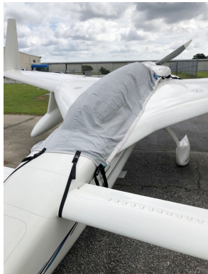
Cozy All Models Travel Cover, Light Weight Canopy Cover, Mark IV Models

Travel Covers are made with Silver Solution-Dyed Polyester fabric and only lined over the windshield to save weight. The material is lightweight and more compact for easy stowage in the aircraft. The polyester material is water resistant, but only intended for occasional use outside. We also have an ultra lightweight material available for fitted hangar dust covers. For daily outdoor use, the non-travel Sunbrella Cover is the best choice.