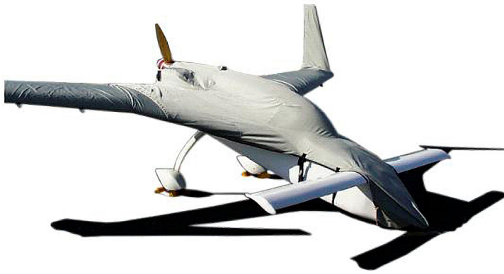
Long-EZ Canopy/Engine and Wing Covers

water resistance, UV resistance and anti-static buildup. The inner lining is a very soft and smooth microfiber to prevent scratching. The material is very reflective, and tests show that the cabin interior temperature can be reduced to near-ambient temperature on the hottest of days. It is water, ice and snow repellent, yet breathable to allow moisture to escape from between the cover and the aircraft surface.