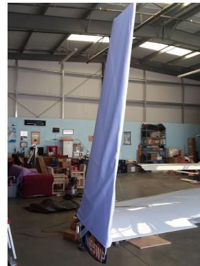
Velocity Vertical Stabilizer Covers, test fit cover