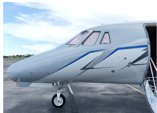
Cessna Citation 650 Cockpit HeataShields