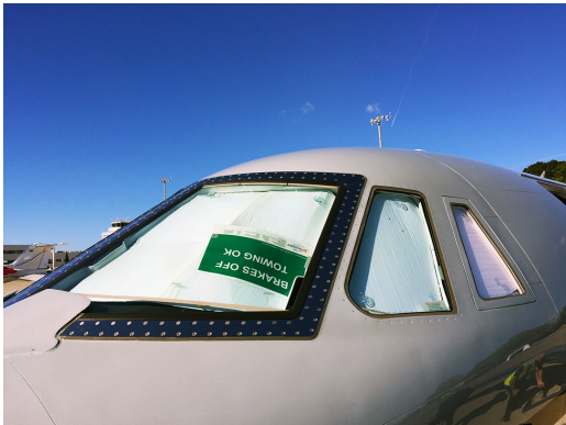
Cessna Citation XL, XLS (560XL) Cockpit Heatshields