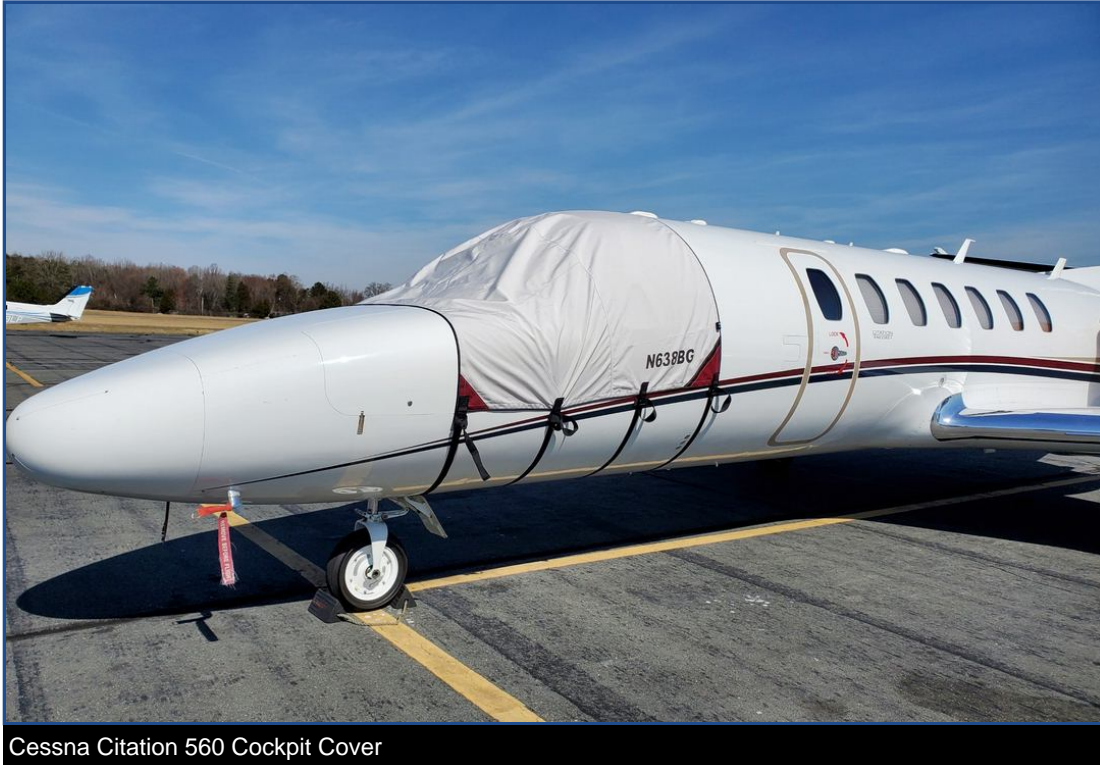
Cessna Citation 560 Cockpit Cover