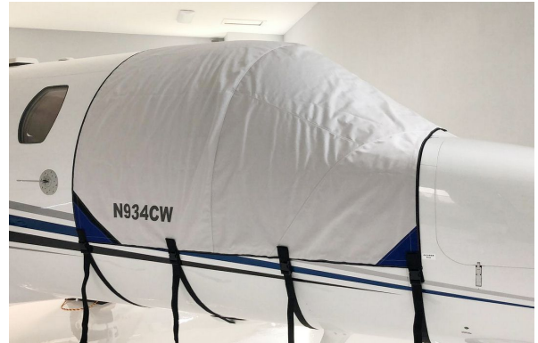
Cessna Citation M2 Cockpit Cover