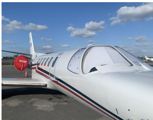
Cessna Citation S550

Cockpit Heatshields are interior sunshades for the aircraft's cockpit. The product is a unique composite of closed-cell foam with a silver mylar finish. The semi-rigid design is stiff enough to stand inside the window framing. The set folds up flat and is easily stored in the included storage sleeve. Some designs may require velcro and suction cups. Our Heatshields for jets are offered white side out because some aircraft manufacturers have issued advisories against reflective window inserts due to potential heat damage. A Heatshield is an excellent short-term remedy for cockpit overheating, but an external fabric cover is more effective for long-term protection.