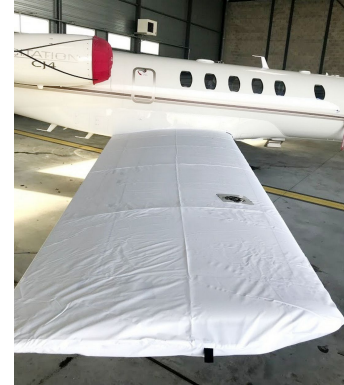
Cessna Citation CJ-4 Wing Covers, test fit cover