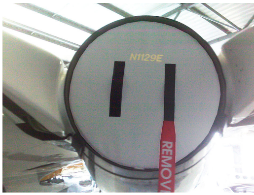
Citation XLS Exhaust Plugs