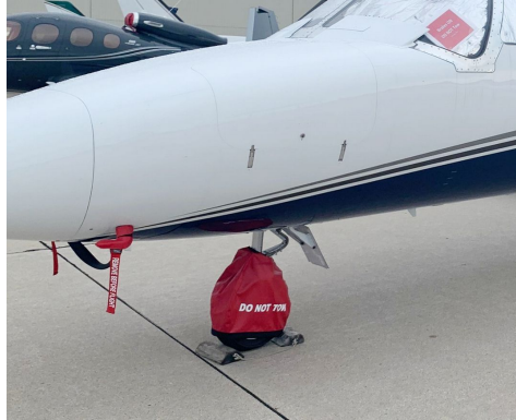
Cessna Citation Nose Tire Cover

ALL-YEAR USE MATERIAL - Made with Silver Acrylic Sunbrella canvas, the all-year use material is the best option for sun protection and cover longevity. This heavier more durable material is intended for all weather conditions, such as rain and snow or lots of sun.