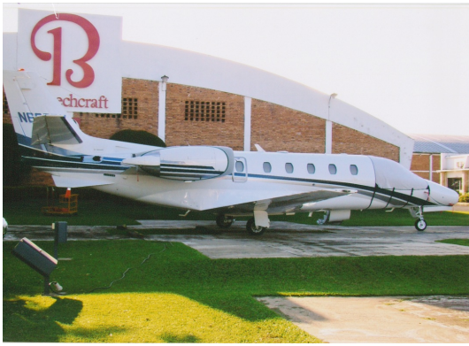
Citation XL Cockpit Cover & Bikini Type Engine Cover