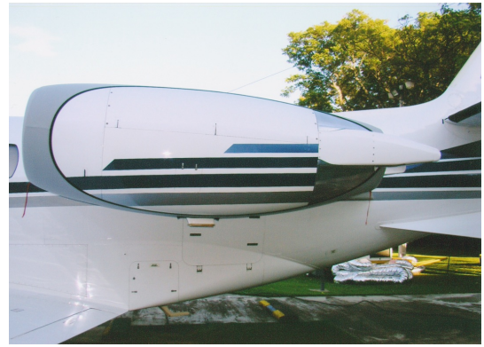
Citation XL Bikini Style Engine Covers