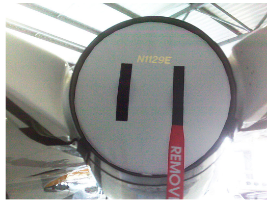
Citation XLS Exhaust Plugs