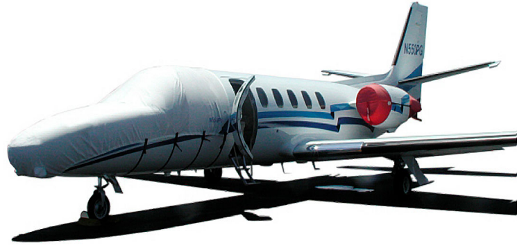
Cessna Citation Nose/Cockpit Cover, Engine Covers