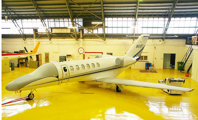
Cessna Citationjet CJ3 Cockpit/Nose, Engine & Wings Travel Covers

WINTER USE MATERIAL - Made with Solution-Dyed Polyester fabric, this option is intended for seasonal use to aid in deicing, rain mitigation, or for occasional travel. The material is lighter and more compact, but more susceptible to UV damage and may have a shorter useful life if used continuously outside than the all-year use material.