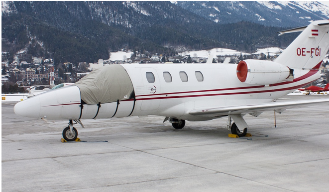
Cessna Citationjet CJ1 Cockpit Cover

This cover type is made from Silver Acrylic Sunbrella canvas and is 100% lined with a soft and smooth microfiber. Bruce's Custom Covers developed this material combination especially for aircraft protection. The outer material is medium weight and treated for water resistance, UV resistance and anti-static buildup. The inner lining is a very soft and smooth microfiber to prevent scratching. The material is very reflective, and tests show that the cabin interior temperature can be reduced to near-ambient temperature on the hottest of days. It is water, ice and snow repellent, yet breathable to allow moisture to escape from between the cover and the aircraft surface.