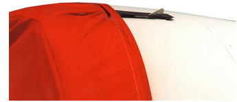
Alternate Intake Cover Design