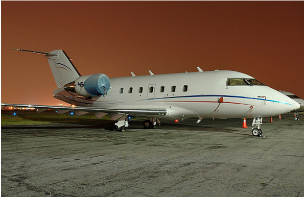
Challenger 601 Intake Covers, standard design

The Canadair Regional Jet 200, 700 Bikini Style Engine Covers are a single-piece design using a soft and smooth stretchy and fabric. The cover stretches tightly over both the intake and exhaust, installing quickly and easily. These covers are designed to be used as hangar dust covers and have a useful life of approximately one year.