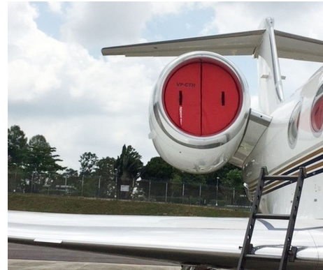
Grumman Gulfstream G450 Intake Plugs