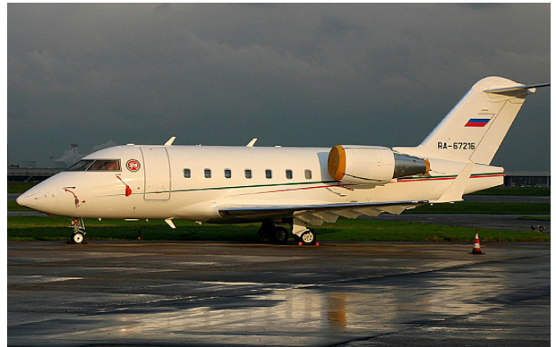
Challenger 604 Intake Covers, OEM design