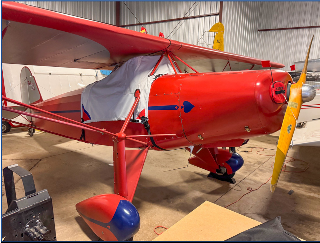
Corben Baby Ace, Junior Ace, and similar models Cockpit Cover