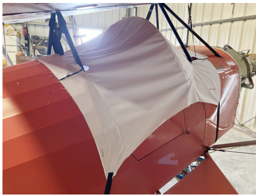
Corben Junior Ace Cockpit Cover, test fit cover