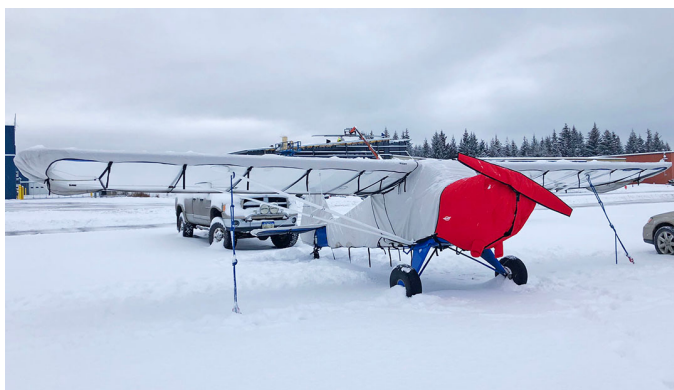
Taylorcraft Aviation Corp F19 Insulated Engine Cover