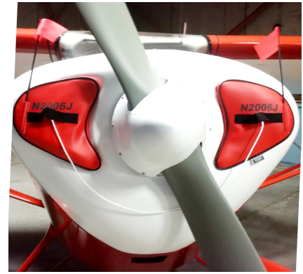
Taylorcraft Engine Inlet Plugs