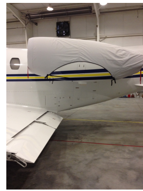
Citationjet 525C, CJ4, Complete Nacelle Cover, light weight Spandex Cessna Citation 560XL Upper Nacelle/Brightwork Covers