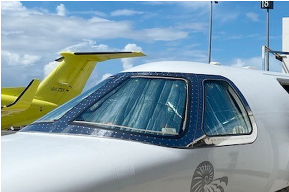
Cessna Citationjet CJ2 Cockpit HeatShields

Cockpit Heatshields are interior sunshades for the aircraft's cockpit. The product is a unique composite of closed-cell foam with a silver mylar finish. The semi-rigid design is stiff enough to stand inside the window framing. The set folds up flat and is easily stored in the included storage sleeve. Some designs may require velcro and suction cups. Our Heatshields for jets are offered white side out because some aircraft manufacturers have issued advisories against reflective window inserts due to potential heat damage. A Heatshield is an excellent short-term remedy for cockpit overheating, but an external fabric cover is more effective for long-term protection.