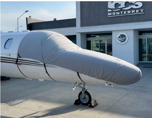
Citation CJ4 Cockpit/Nose Cover and Heat Resistant Pitot Covers set Cessna Citationjet 525B Travel Weight Cockpit/Nose Cover