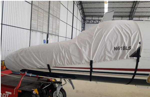
Citationjet 525B Cockpit/Nose Cover

This cover type is made from Silver Acrylic Sunbrella canvas and is 100% lined with a soft and smooth microfiber. Bruce's Custom Covers developed this material combination especially for aircraft protection. The outer material is medium weight and treated for water resistance, UV resistance and anti-static buildup. The inner lining is a very soft and smooth microfiber to prevent scratching. The material is very reflective, and tests show that the cabin interior temperature can be reduced to near-ambient temperature on the hottest of days. It is water, ice and snow repellent, yet breathable to allow moisture to escape from between the cover and the aircraft surface.