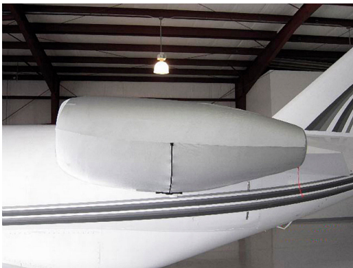
Citation CJ3 Bikini Style Engine Cover Set, full nacelle enclosure