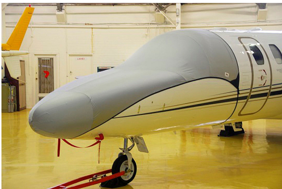
Citationjet CJ3 Cockpit/Nose Travel Cover