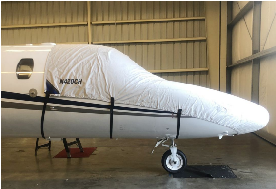
Cessna Citationjet CJ3 Cockpit/Nose Cover

This cover type is made from Silver Acrylic Sunbrella canvas and is 100% lined with a soft and smooth microfiber. Bruce's Custom Covers developed this material combination especially for aircraft protection. The outer material is medium weight and treated for water resistance, UV resistance and anti-static buildup. The inner lining is a very soft and smooth microfiber to prevent scratching. The material is very reflective, and tests show that the cabin interior temperature can be reduced to near-ambient temperature on the hottest of days. It is water, ice and snow repellent, yet breathable to allow moisture to escape from between the cover and the aircraft surface.