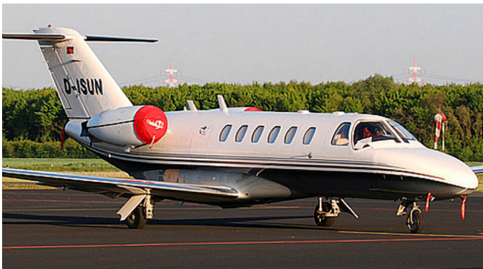
Engine Inlet/Exhaust Covers

The Cessna Citationjet 525A, CJ-2, & CJ2+ Intake/Exhaust Plugs are custom fit for the intake and exhaust openings, made with heavy-duty vinyl material, and stuffed with a single block of sculpted urethane foam. Each plug has a zipper that allows the foam to be removed and dried if necessary. Engine plugs have 'remove before flight' streamers sewn onto the face of the plugs. Most plugs are imprinted with the aircraft registration number in black. Engine plugs may be inserted after flight when the engine is still warm. Engine Inlet Plugs are commonly referred to as Cowl Plugs, Intake Plugs, Cowl Blocks, Engine Blocks, and Engine Bungs.