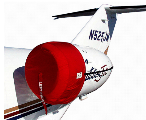
Engine Inlet Cover