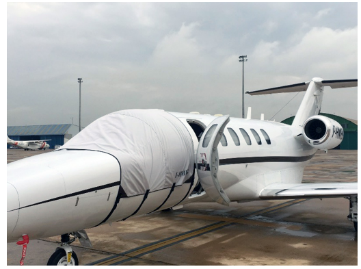
Cessna Citationjet 525A, CJ-2, & CJ2+ Cockpit Cover