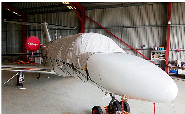
Citation CJ-1 Canopy Cover and Engine Covers

Travel Covers are made with Silver Solution-Dyed Polyester fabric and only lined over the windshield to save weight. The material is lightweight and more compact for easy stowage in the aircraft. The polyester material is water resistant, but only intended for occasional use outside. We also have an ultra lightweight material available for fitted hangar dust covers. For daily outdoor use, the non-travel Sunbrella Cover is the best choice.