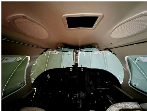
Cessna 525A Cockpit heatshields

Custom-made Heatshield Sunshades are available for almost any window in the jet. Side windows, Skylights, and Emergency Exits are all custom-made. The product is a unique composite of closed-cell foam with a silver mylar finish. The set is easily stored in the included storage sleeve. Some designs may require velcro and suction cups. Our Heatshields are offered white side out since aircraft manufacturers have issued advisories against reflective window inserts due to potential heat damage.