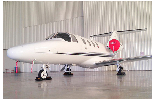
Cessna CJ1 Intake Cover