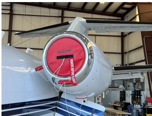
Cessna Citationjet 525A Intake Plugs Set

The Engine Inlet Plugs are custom fit for your Cessna Citationjet 525A, CJ-2, & CJ2+ intakes, made with heavy-duty vinyl material, and stuffed with a single block of sculpted urethane foam. Each plug has a zipper that allows the foam to be removed and dried if necessary. Engine plugs have 'remove before flight' streamers sewn onto the face of the plugs. Most plugs are imprinted with the aircraft registration number in black for an extra charge. Storage bag NOT included. Engine plugs may be inserted after flight when the engine is still warm. Engine Inlet Plugs are commonly referred to as Cowl Plugs, Intake Plugs, Cowl Blocks, Engine Blocks, and Engine Bungs.