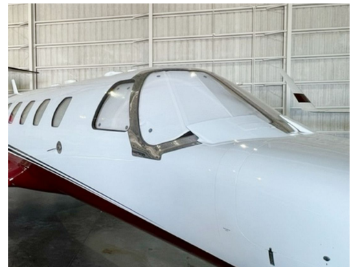
Cessna 525A Cockpit heatshields