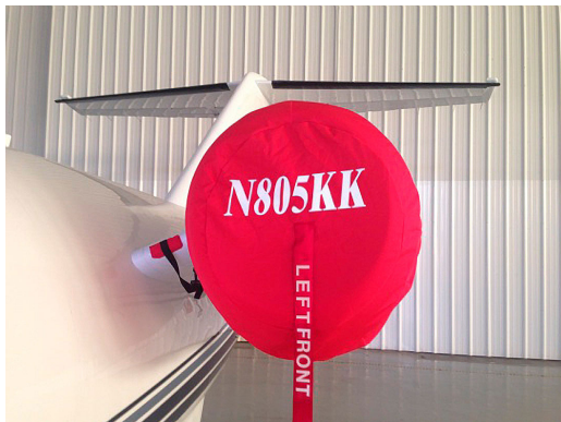
Cessna CJ1 Intake Cover and Inlet Plug

The Cessna Citationjet 525A, CJ-2, & CJ2+ Intake/Exhaust Plugs are custom fit for the intake and exhaust openings, made with heavy-duty vinyl material, and stuffed with a single block of sculpted urethane foam. Each plug has a zipper that allows the foam to be removed and dried if necessary. Engine plugs have 'remove before flight' streamers sewn onto the face of the plugs. Most plugs are imprinted with the aircraft registration number in black. Engine plugs may be inserted after flight when the engine is still warm. Engine Inlet Plugs are commonly referred to as Cowl Plugs, Intake Plugs, Cowl Blocks, Engine Blocks, and Engine Bungs.