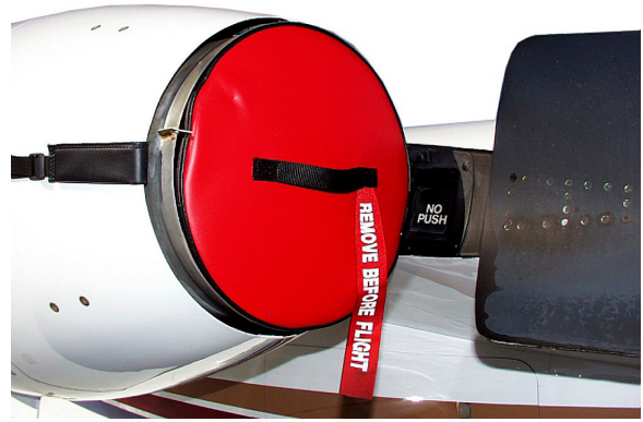
Engine Exhaust Plug