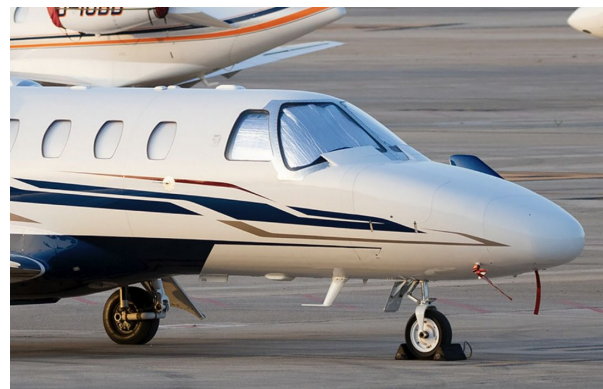
Cessna Citationjet 525, CJ-I, CJ1+, & M2 Cockpit Heatshields