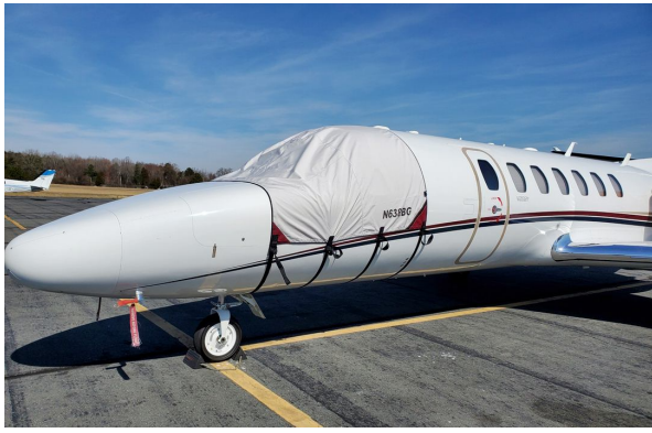
Cessna Citation 560 Cockpit Cover