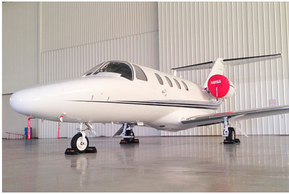
Cessna CJ1 Intake Cover