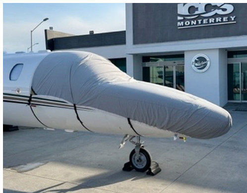
Cessna Citationjet 525B Travel Weight Cockpit/Nose Cover

Travel Covers are made with Silver Solution-Dyed Polyester fabric and only lined over the windshield to save weight. The material is lightweight and more compact for easy stowage in the aircraft. The polyester material is water resistant, but only intended for occasional use outside. We also have an ultra lightweight material available for fitted hangar dust covers. For daily outdoor use, the non-travel Sunbrella Cover is the best choice.