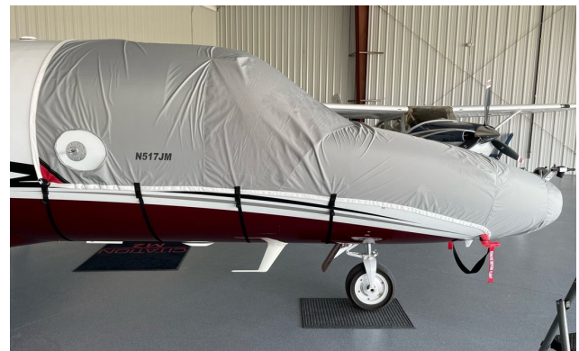
Cessna Citationjet M2 Light Weight Travel Cockpit/Nose Cover