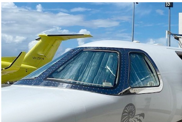
Cessna Citationjet CJ2 Cockpit HeatShields

Custom-made Heatshield Sunshades are available for almost any window in the jet. Side windows, Skylights, and Emergency Exits are all custom-made. The product is a unique composite of closed-cell foam with a silver mylar finish. The set is easily stored in the included storage sleeve. Some designs may require velcro and suction cups. Our Heatshields are offered white side out since aircraft manufacturers have issued advisories against reflective window inserts due to potential heat damage.