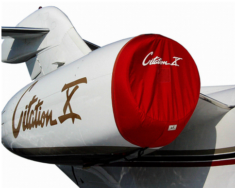
Citation X Intake Covers

The Cessna Citation X (750) Intake Covers are designed to install easily yet be completely storable. A spring steel hoop is sewn into the hem of each cover, allowing them to be installed without climbing onto the wing or using a stepladder. To store the covers the spring steel hoop folds like a band-saw blade into three nesting rings. Each cover folds into a compact circular bundle which is stored in the included duffle bag, yet they unfold quickly for use. The Tri-Fold Ring cover is made of medium weight nylon which is available in a variety of colors to match the paint trim. Each cover set comes complete with installation and folding instructions. The aircraft's registration number can be silkscreened onto the cover for an extra charge.