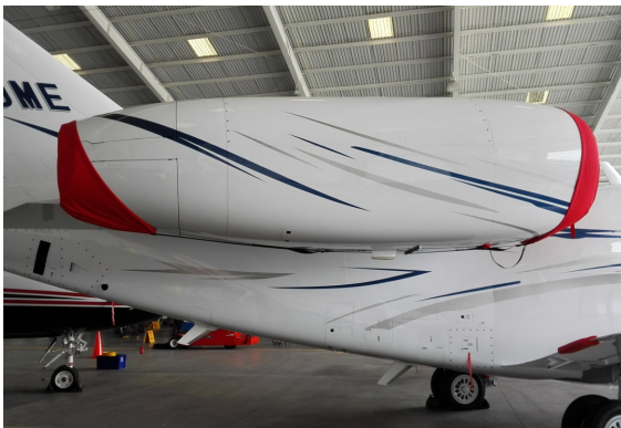
Citation X Intake/Exhaust Cover Set

The Cessna Citation X (750) Intake Covers are designed to install easily yet be completely storable. A spring steel hoop is sewn into the hem of each cover, allowing them to be installed without climbing onto the wing or using a stepladder. To store the covers the spring steel hoop folds like a band-saw blade into three nesting rings. Each cover folds into a compact circular bundle which is stored in the included duffle bag, yet they unfold quickly for use. The Tri-Fold Ring cover is made of medium weight nylon which is available in a variety of colors to match the paint trim. Each cover set comes complete with installation and folding instructions. The aircraft's registration number can be silkscreened onto the cover for an extra charge.