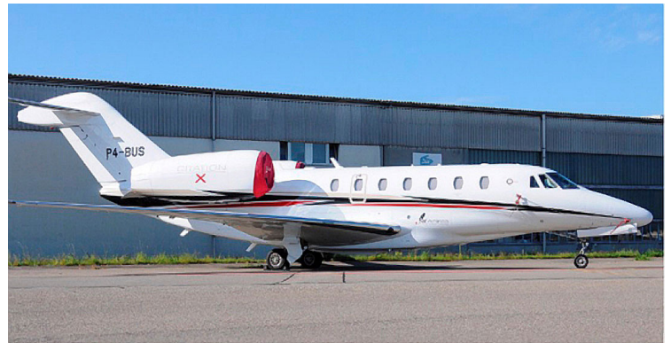
Citation X Intake & Pitot Tube Covers