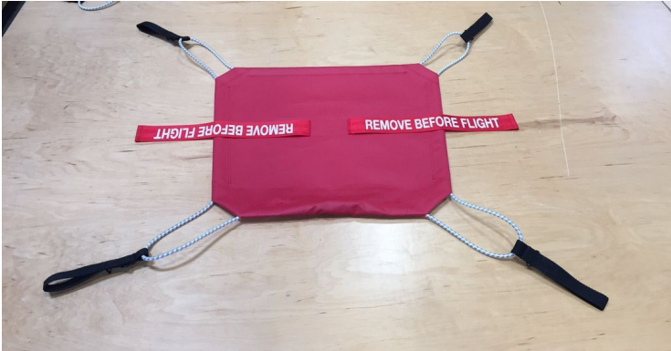
Boeing Vertol CH-47 Chinook Forward Pylon Top Inlet Screen Cover

Insulated Covers Material - A special composite material of solution-dyed polyester, 3M Thinsulate insulation, and soft nylon interior fabric. Our insulated covers are designed to complement an engine preheater and help retain heat in the engine compartment after shutdown. If you operate your aircraft in cold-weather, these covers will help prevent engine wear and tear.