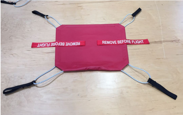
Boeing Vertol CH-47 Chinook Forward Pylon Top Inlet Screen Cover