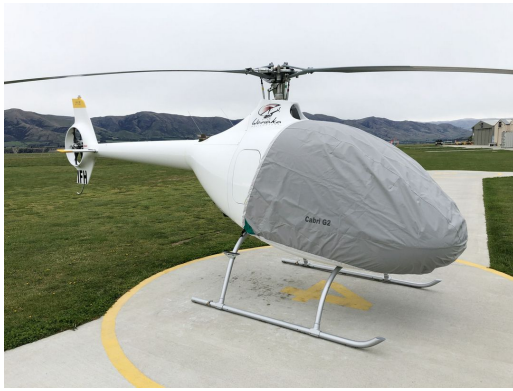
Guimbal Cabri CG2 Bubble Cover, light weight travel type