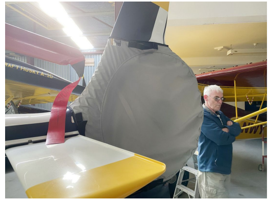
Guimbal Cabri G2 Tailfan Housing Fenestron Cover