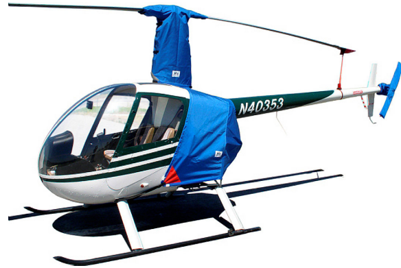
Robinson R-22 Engine, Rotor Mast & Tail Rotor Covers, with Blade Tie-down