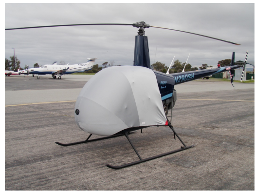
Robinson R-22 Light Weight Travel Cover