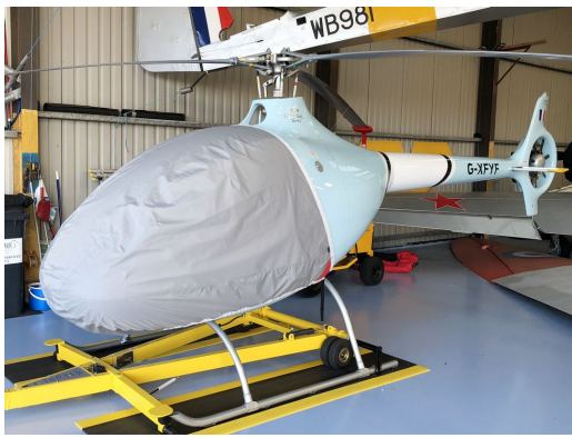
Cabri G2 Light Weight Travel Bubble Cover