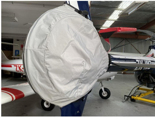
Guimbal Cabri G2 Tailfan Housing Fenestron Cover