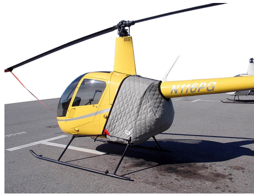
Guimbal Cabri G2 Bubble Cover, 3D model Robinson R-22 Insulated Engine Cover (also covers bottom) & Front Blade Tie-down