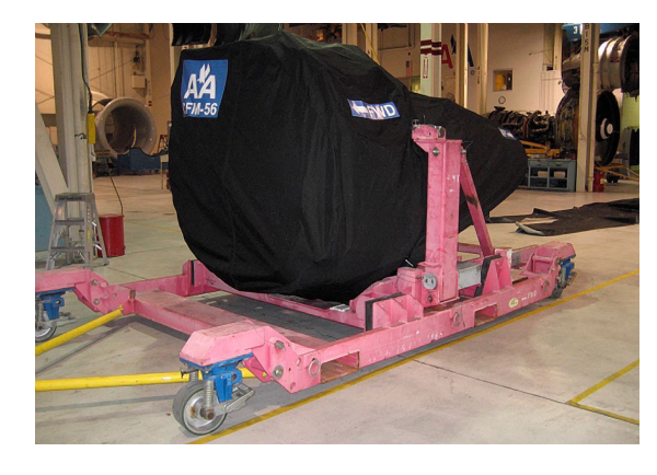
CFM-56-7 Off-link Engine Shipper/Transport cover, w/ Exhaust Cone, fully enclosed