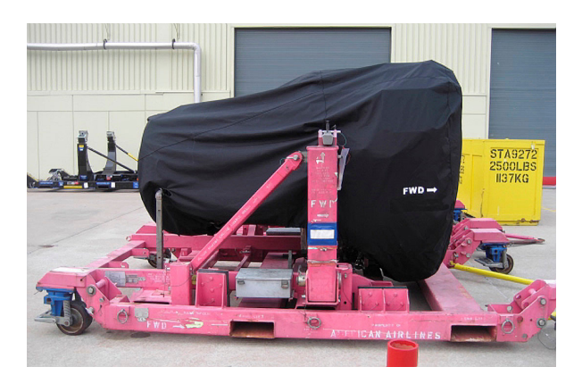
CFM-56-7 Off-link Engine Long-term Storage "Rain Cap" cover, w/o Exhaust Cone, fully enclosed