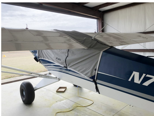
Cub Crafters Carbon Cub Travel Weight Canopy Cover