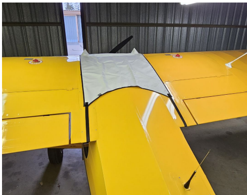
Piper PA-12: Super Cruiser, J5 Cub Windshield/Skylight Cover

This cover type is made from Silver Acrylic Sunbrella canvas and is 100% lined with a soft and smooth microfiber. Bruce's Custom Covers developed this material combination especially for aircraft protection. The outer material is medium weight and treated for water resistance, UV resistance and anti-static buildup. The inner lining is a very soft and smooth microfiber to prevent scratching. The material is very reflective, and tests show that the cabin interior temperature can be reduced to near-ambient temperature on the hottest of days. It is water, ice and snow repellent, yet breathable to allow moisture to escape from between the cover and the aircraft surface.