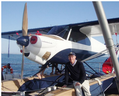
Cub Crafters CC-11 Engine Plugs

Engine Inlet Plugs are custom fit for your CubCrafters CC-11, Sport Cub S2, & Carbon Cub intakes, made with heavy-duty vinyl material, and stuffed with a single block of sculpted urethane foam. Each plug has a zipper that allows the foam to be removed and dried if necessary. Engine plugs have warning flags that are visible from the cockpit or 'remove before flight' streamers sewn onto the face of the plugs. Most plugs are imprinted with the aircraft registration number in black for an extra charge. Storage bag NOT included. Engine plugs may be inserted after flight when the engine is still warm. Engine Inlet Plugs are commonly referred to as Cowl Plugs, Intake Plugs, Cowl Blocks, Engine Blocks, and Engine Bungs.