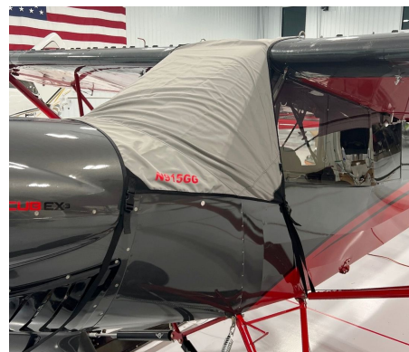
Cub Crafters CC11-004: WINDSHIELD/SKYLIGHT COVER