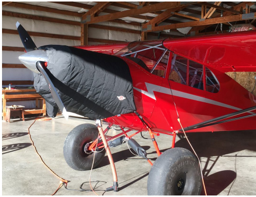
Piper PA-12 Insulated Engine Cover