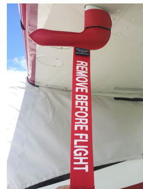
Cessna A185F Pitot Cover