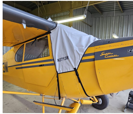
Piper PA-12: Super Cruiser, J5 Cub Windshield/Skylight Cover