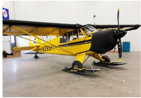
Aviat Husky Insulated Engine Cover, Wing Covers