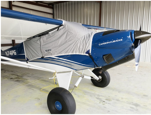
Cub Crafters Carbon Cub Travel Weight Canopy Cover