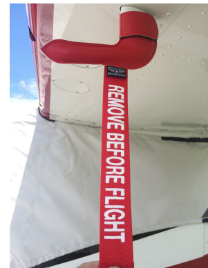
Cessna A185F Pitot Cover