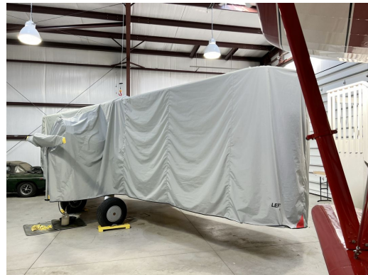
Stearman PT-13 Full Body Dust Cover, Prop Cover Included