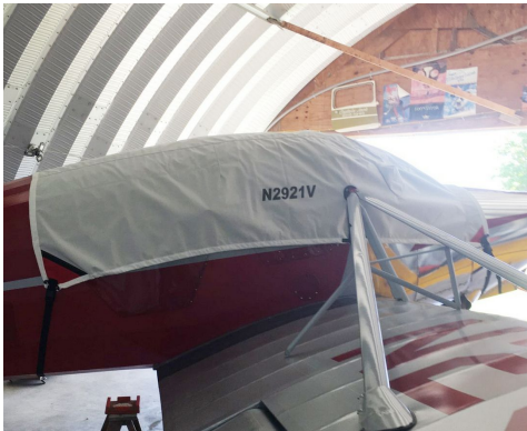
Callair A-2 Canopy Cover

Canopy Covers are commonly referred to as Cabin Covers, Fuselage Covers, Canvas Covers, Canopy Caps, etc.