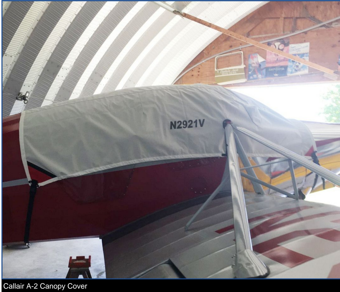
Callair A-2 Canopy Cover