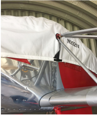
Callair A-2 Canopy Cover

Canopy Covers are commonly referred to as Cabin Covers, Fuselage Covers, Canvas Covers, Canopy Caps, etc.