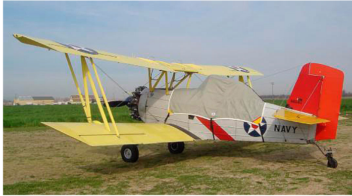
Grumman Ag Cat Canopy Cover