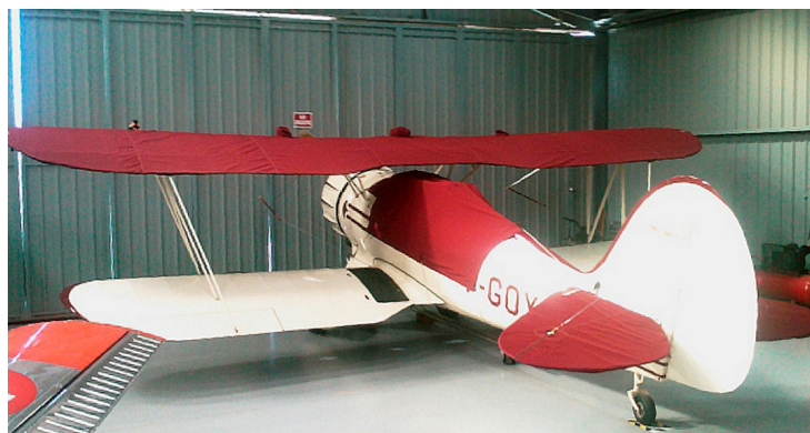
Waco UPF-7 Upper Wing Cover, Horizontal Stabilizer Cover & Canopy Cover

WINTER USE MATERIAL - Made with Solution-Dyed Polyester fabric, this option is intended for seasonal use to aid in deicing, rain mitigation, or for occasional travel. The material is lighter and more compact, but more susceptible to UV damage and may have a shorter useful life if used continuously outside than the all-year use material.