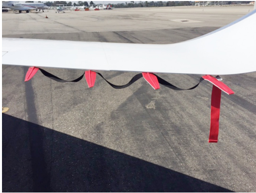
Citation X Static Wick Protectors

ALL-YEAR USE MATERIAL - Made with Silver Acrylic Sunbrella canvas, the all-year use material is the best option for sun protection and cover longevity. This heavier more durable material is intended for all weather conditions, such as rain and snow or lots of sun.