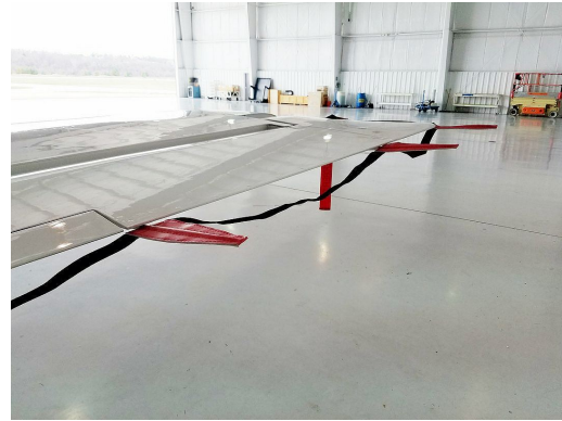
Hawker Beechcraft 800, 800XP, 850XP Static Wick Protectors