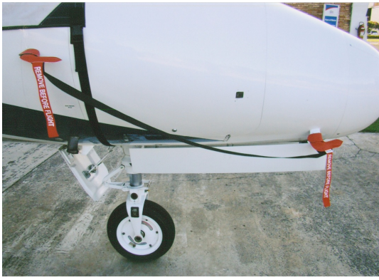
Citation XL Pitot Covers