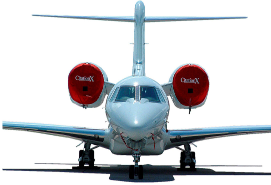
Citation X Intake Covers

which is stored in the included duffel bag, yet they unfold quickly for use. The Tri-Fold Ring cover is made of medium weight nylon which is available in a variety of colors to match the paint trim. Each cover set comes complete with installation and folding instructions. The aircraft's registration number can be silkscreened onto the cover for an extra charge.