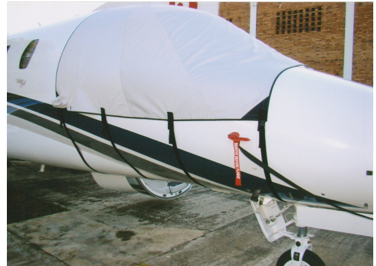
Citation XL Cockpit Cover