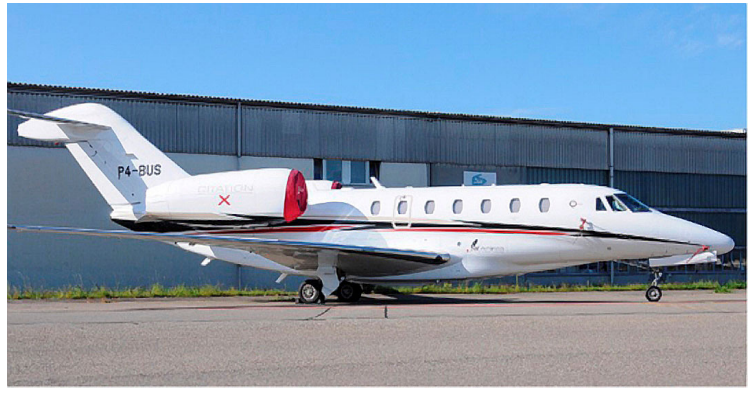
Citation X Intake & Pitot Tube Covers