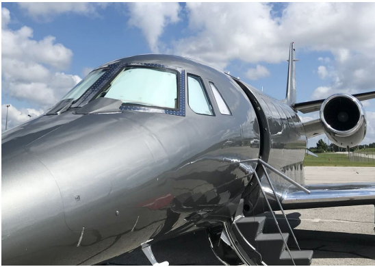
Cessna Citation 560XL Cockpit HeatShields

Cockpit Heatshields are interior sunshades for the aircraft's cockpit. The product is a unique composite of closed-cell foam with a silver mylar finish. The semi-rigid design is stiff enough to stand inside the window framing. The set folds up flat and is easily stored in the included storage sleeve. Some designs may require velcro and suction cups. Our Heatshields for jets are offered white side out because some aircraft manufacturers have issued advisories against reflective window inserts due to potential heat damage. A Heatshield is an excellent short-term remedy for cockpit overheating, but an external fabric cover is more effective for long-term protection.