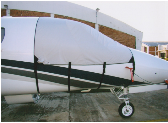
Citation XL Cockpit Cover