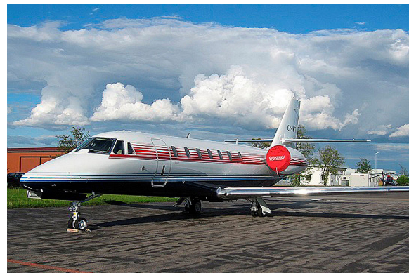
Citation Sovereign Engine Covers