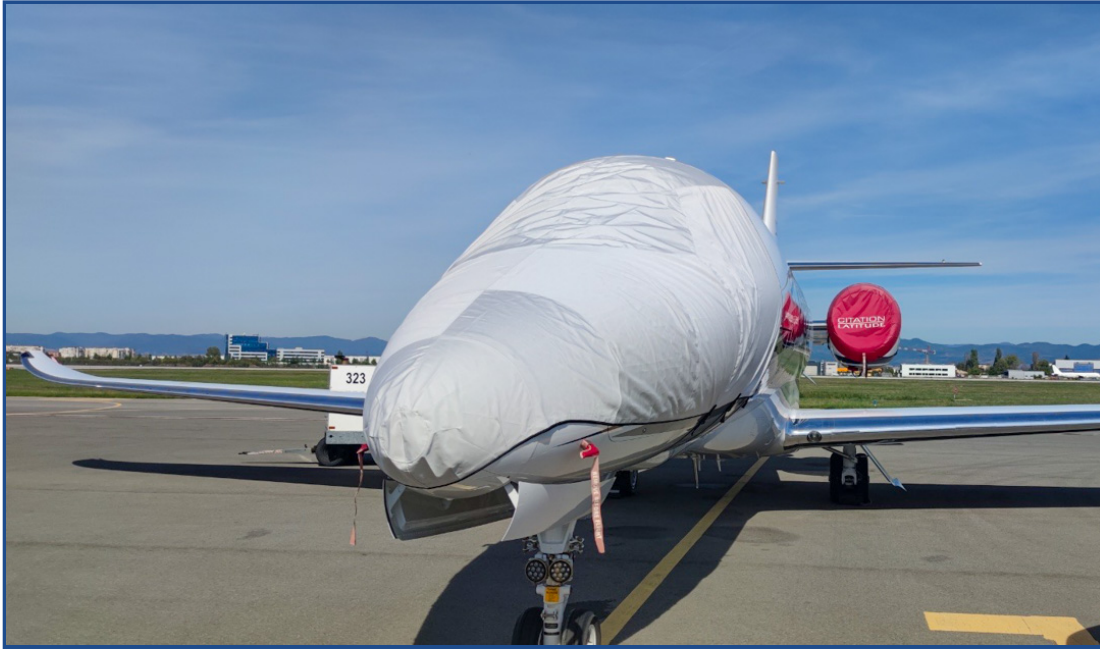
Cessna Citation Latitude (680A) Cockpit/Nose Cover, Doesn't Cover Pitot Tubes