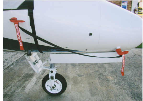
Citation XL Pitot Covers