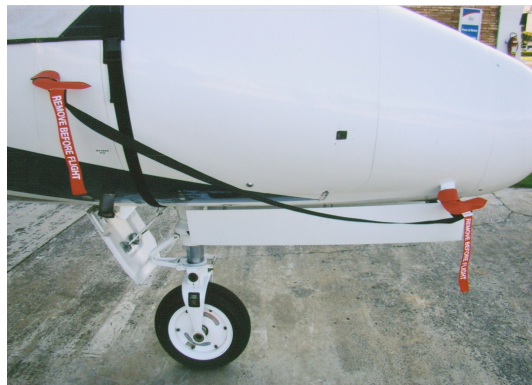
Citation XL Pitot Covers