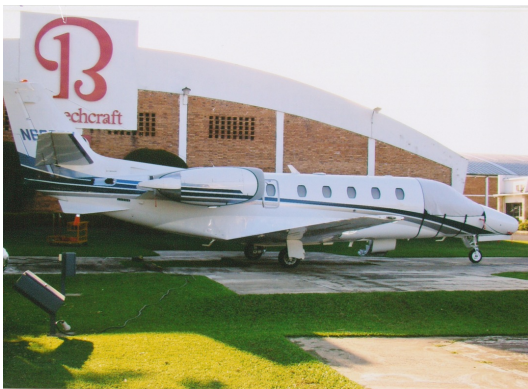
Citation XL Cockpit Cover & Bikini Type Engine Cover

The Cessna Citation VII (650) Intake/Exhaust Plugs are custom fit for the intake and exhaust openings, made with heavy-duty vinyl material, and stuffed with a single block of sculpted urethane foam. Each plug has a zipper that allows the foam to be removed and dried if necessary. Engine plugs have 'remove before flight' streamers sewn onto the face of the plugs. Most plugs are imprinted with the aircraft registration number in black. Engine plugs may be inserted after flight when the engine is still warm. Engine Inlet Plugs are commonly referred to as Cowl Plugs, Intake Plugs, Cowl Blocks, Engine Blocks, and Engine Bungs.