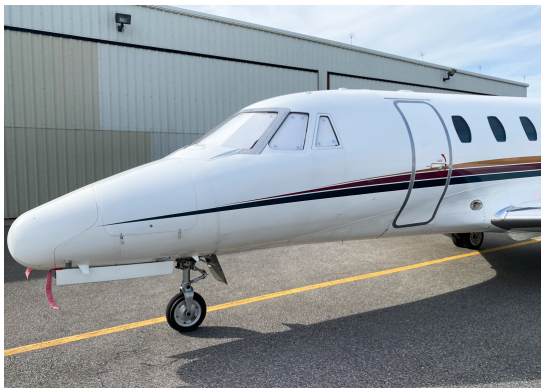
Cessna 650 Cockpit Heatshields (set of 6)

Cockpit Heatshields are interior sunshades for the aircraft's cockpit. The product is a unique composite of closed-cell foam with a silver mylar finish. The semi-rigid design is stiff enough to stand inside the window framing. The set folds up flat and is easily stored in the included storage sleeve. Some designs may require velcro and suction cups. Our Heatshields for jets are offered white side out because some aircraft manufacturers have issued advisories against reflective window inserts due to potential heat damage. A Heatshield is an excellent short-term remedy for cockpit overheating, but an external fabric cover is more effective for long-term protection.