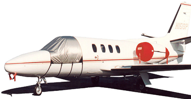
Cessna Citation I Windshield, Pitot and Engine Covers

This cover type is made from Silver Acrylic Sunbrella canvas and is 100% lined with a soft and smooth microfiber. Bruce's Custom Covers developed this material combination especially for aircraft protection. The outer material is medium weight and treated for water resistance, UV resistance and anti-static buildup. The inner lining is a very soft and smooth microfiber to prevent scratching. The material is very reflective, and tests show that the cabin interior temperature can be reduced to near-ambient temperature on the hottest of days. It is water, ice and snow repellent, yet breathable to allow moisture to escape from between the cover and the aircraft surface.