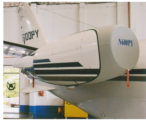
Citation XL Bikini Style Engine Covers