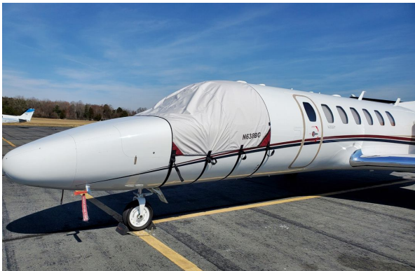
Cessna Citation 560 Cockpit Cover