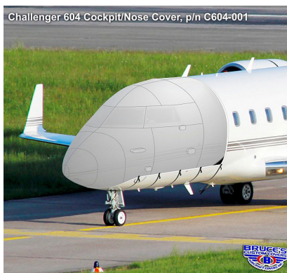
Challenger 601/604 Cockpit/Nose Cover, illustration

This cover type is made from Silver Acrylic Sunbrella canvas and is 100% lined with a soft and smooth microfiber. Bruce's Custom Covers developed this material combination especially for aircraft protection. The outer material is medium weight and treated for water resistance, UV resistance and anti-static buildup. The inner lining is a very soft and smooth microfiber to prevent scratching. The material is very reflective, and tests show that the cabin interior temperature can be reduced to near-ambient temperature on the hottest of days. It is water, ice and snow repellent, yet breathable to allow moisture to escape from between the cover and the aircraft surface.