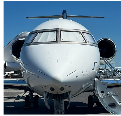
Bombardier CL-600-2B16 Cockpit Heatshields