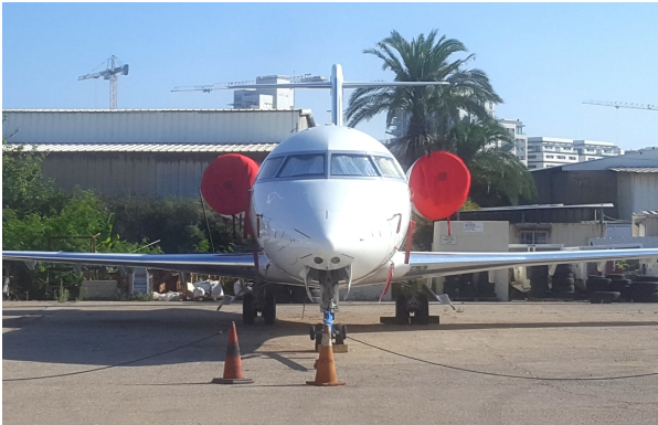
Canadair Challenger 604, 605, 650, 850 Intake Covers