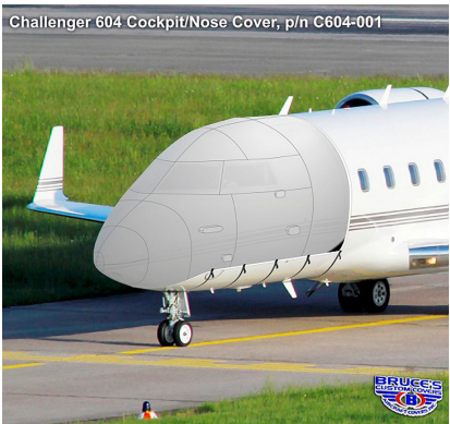
Challenger 601/604 Cockpit/Nose Cover, illustration

This cover type is made from Silver Acrylic Sunbrella canvas and is 100% lined with a soft and smooth microfiber. Bruce's Custom Covers developed this material combination especially for aircraft protection. The outer material is medium weight and treated for water resistance, UV resistance and anti-static buildup. The inner lining is a very soft and smooth microfiber to prevent scratching. The material is very reflective, and tests show that the cabin interior temperature can be reduced to near-ambient temperature on the hottest of days. It is water, ice and snow repellent, yet breathable to allow moisture to escape from between the cover and the aircraft surface.