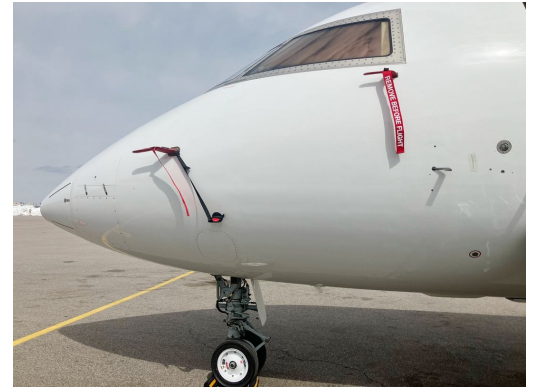
Challenger 650 Pitot & Ice Detector Covers