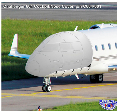
Challenger 601/604 Cockpit/Nose Cover, illustration

This cover type is made from Silver Acrylic Sunbrella canvas and is 100% lined with a soft and smooth microfiber. Bruce's Custom Covers developed this material combination especially for aircraft protection. The outer material is medium weight and treated for water resistance, UV resistance and anti-static buildup. The inner lining is a very soft and smooth microfiber to prevent scratching. The material is very reflective, and tests show that the cabin interior temperature can be reduced to near-ambient temperature on the hottest of days. It is water, ice and snow repellent, yet breathable to allow moisture to escape from between the cover and the aircraft surface.