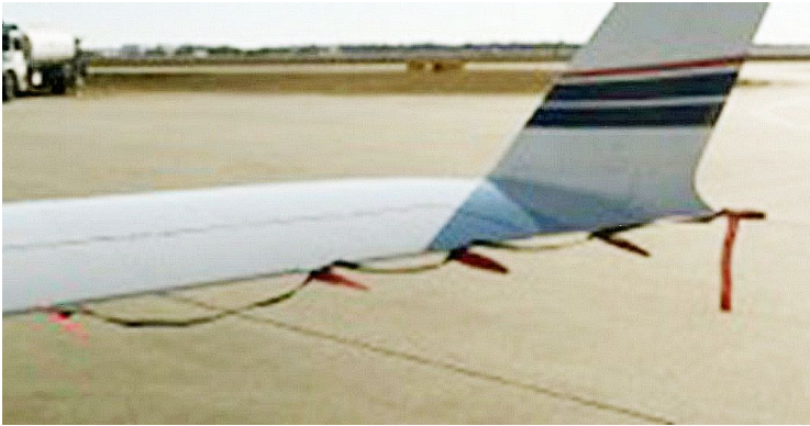
Static Wick Covers

with the aircraft registration number in black for an extra charge. Storage bag NOT included. Engine plugs may be inserted after flight when the engine is still warm. Engine Inlet Plugs are commonly referred to as Cowl Plugs, Intake Plugs, Cowl Blocks, Engine Blocks, and Engine Bungs.