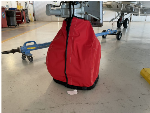
Canadair Challenger 605 Nose Gear Tire Cover

ALL-YEAR USE MATERIAL - Made with Silver Acrylic Sunbrella canvas, the all-year use material is the best option for sun protection and cover longevity. This heavier more durable material is intended for all weather conditions, such as rain and snow or lots of sun.