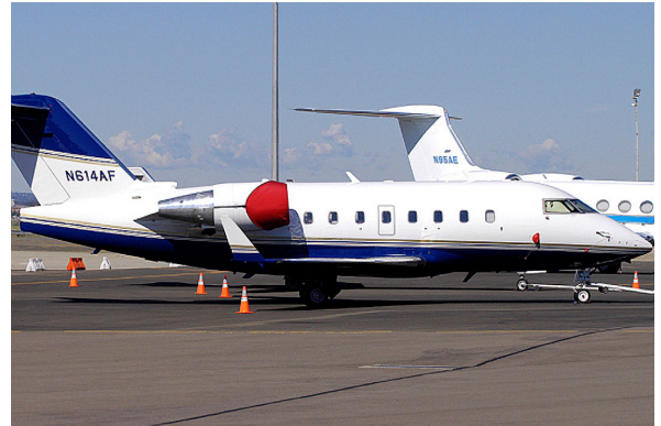
Challenger 604 Intake Covers, standard design