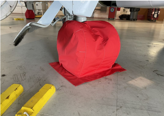
Canadair Challenger 605 Main Gear Tire Covers

ALL-YEAR USE MATERIAL - Made with Silver Acrylic Sunbrella canvas, the all-year use material is the best option for sun protection and cover longevity. This heavier more durable material is intended for all weather conditions, such as rain and snow or lots of sun.