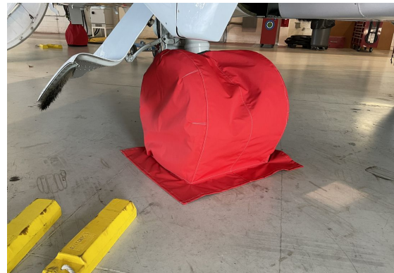
Canadair Challenger 605 Main Gear Tire Covers