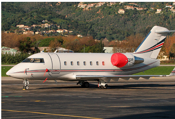
Challenger 601 Intake Covers, standard design