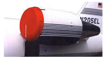
Alternate Intake Cover Design