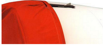
Alternate Intake Cover Design