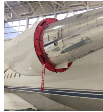
Canadair Challenger 604 Bypass Plugs