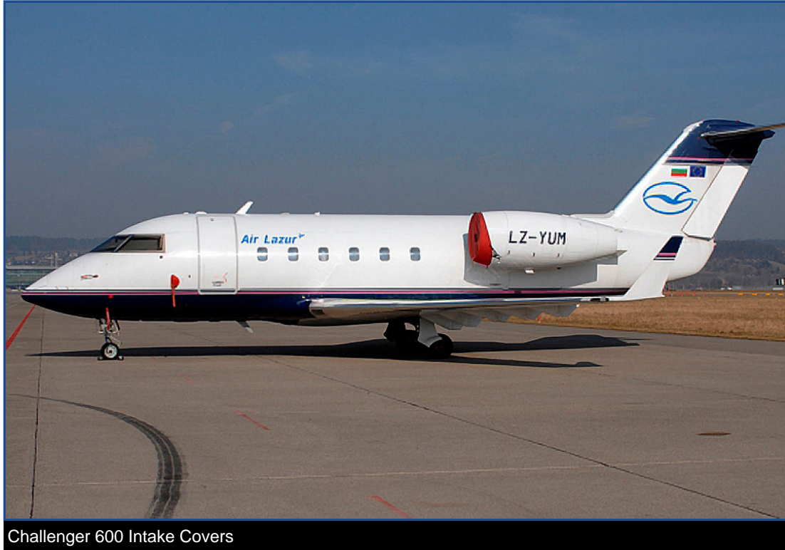
Challenger 600 Intake Covers