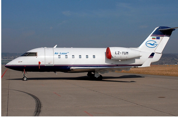
Challenger 600 Intake Covers

The Canadair Challenger 600 Intake Covers are designed to install easily yet be completely storable. A spring steel hoop is sewn into the hem of each cover, allowing them to be installed without climbing onto the wing or using a stepladder. To store the covers the spring steel hoop folds like a band-saw blade into three nesting rings. Each cover folds into a compact circular bundle which is stored in the included duffle bag, yet they unfold quickly for use. The Tri-Fold Ring cover is made of medium weight nylon which is available in a variety of colors to match the paint trim. Each cover set comes complete with installation and folding instructions. The aircraft's registration number can be silkscreened onto the cover for an extra charge.