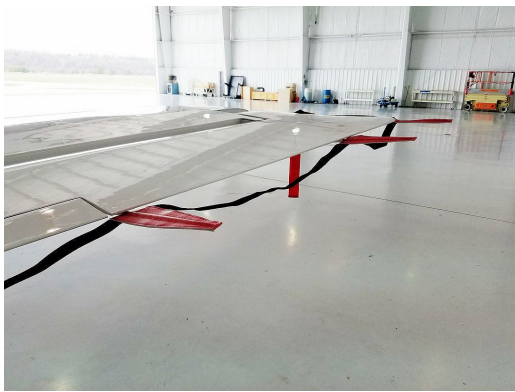
Hawker Beechcraft 800, 800XP, 850XP Static Wick Protectors