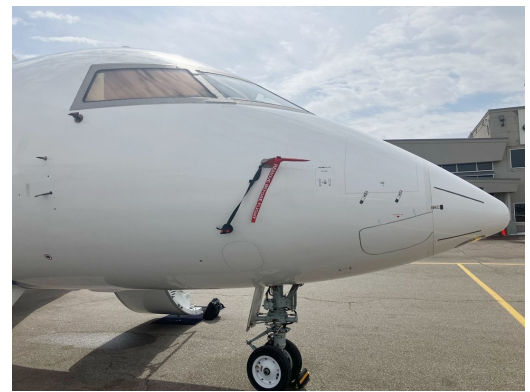
Challenger 650 Pitot & Ice Detector Covers