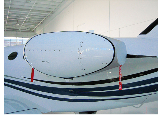
Cessna 550 Intake Covers & Exhaust Plugs, includes wedge plug for nacelle recommended (set of 6)