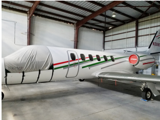
Cessna Citation II Cockpit Cover, Wing Covers

WINTER USE MATERIAL - Made with Solution-Dyed Polyester fabric, this option is intended for seasonal use to aid in deicing, rain mitigation, or for occasional travel. The material is lighter and more compact, but more susceptible to UV damage and may have a shorter useful life if used continuously outside than the all-year use material.