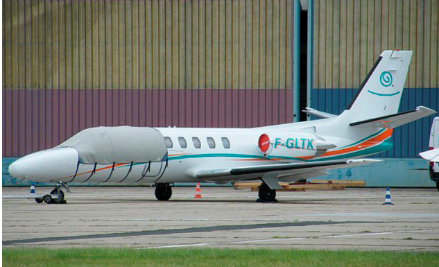
Citation Windshield Cover, to back of door

This cover type is made from Silver Acrylic Sunbrella canvas and is 100% lined with a soft and smooth microfiber. Bruce's Custom Covers developed this material combination especially for aircraft protection. The outer material is medium weight and treated for water resistance, UV resistance and anti-static buildup. The inner lining is a very soft and smooth microfiber to prevent scratching. The material is very reflective, and tests show that the cabin interior temperature can be reduced to near-ambient temperature on the hottest of days. It is water, ice and snow repellent, yet breathable to allow moisture to escape from between the cover and the aircraft surface.