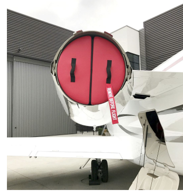
Cessna Citation 680 Exhaust Plugs, folding type