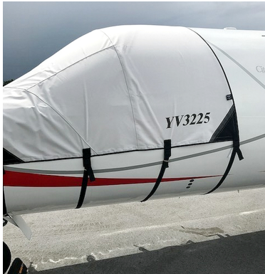
Cessna Citationjet V Ultra (560) Cockpit Cover

This cover type is made from Silver Acrylic Sunbrella canvas and is 100% lined with a soft and smooth microfiber. Bruce's Custom Covers developed this material combination especially for aircraft protection. The outer material is medium weight and treated for water resistance, UV resistance and anti-static buildup. The inner lining is a very soft and smooth microfiber to prevent scratching. The material is very reflective, and tests show that the cabin interior temperature can be reduced to near-ambient temperature on the hottest of days. It is water, ice and snow repellent, yet breathable to allow moisture to escape from between the cover and the aircraft surface.