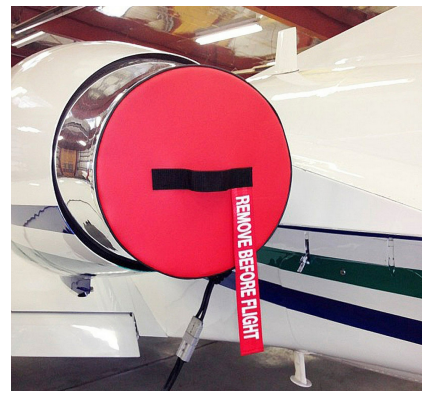
Cessna Citation S2 Exhaust Plugs