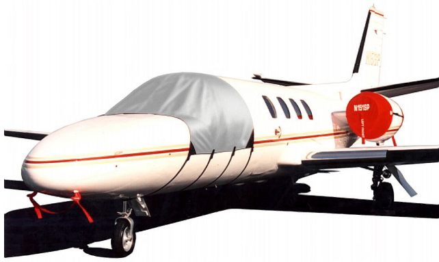
Cessna Citation Windshield Cover, Engine Cover set and Pitot Covers