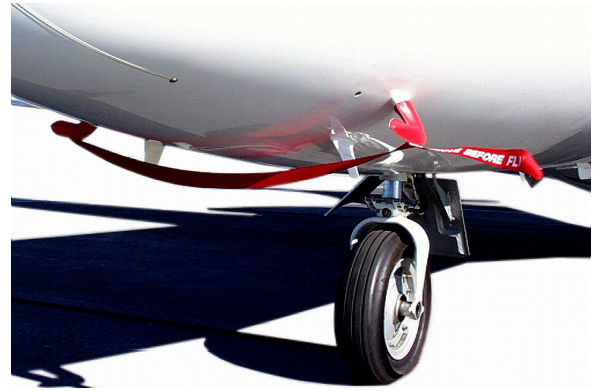
Cessna Citation I Pitot Covers