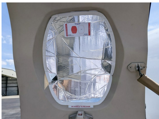
Citationjet Entrance Door Heatshield

Custom-made Heatshield Sunshades are available for almost any window in the jet. Side windows, Skylights, and Emergency Exits are all custom-made. The product is a unique composite of closed-cell foam with a silver mylar finish. The set is easily stored in the included storage sleeve. Some designs may require velcro and suction cups. Our Heatshields are offered white side out since aircraft manufacturers have issued advisories against reflective window inserts due to potential heat damage.